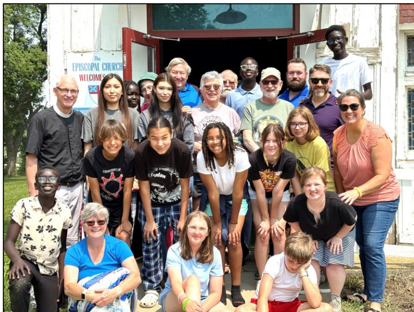
Youth Team from 2025 in Santee

Interested? Then come to our Information Meeting next Sunday, Jan. 25 th right after the late service @ 11:30am. We'll be downstairs in the Oasis Room.