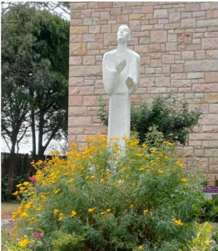
A safe and creative learning space for faith and formation

If you're curious about theology, looking to deepen your faith, exploring ministry opportunities or considering professional development, our Open Day is a great opportunity to: