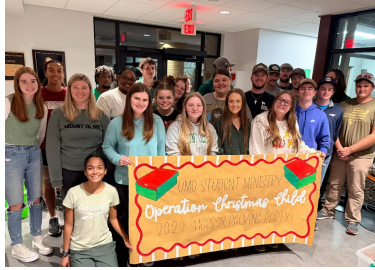
UMO Student Ministries