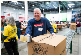
Monday: Volunteer at an OCC Processing Center to inspect and ship OCC boxes