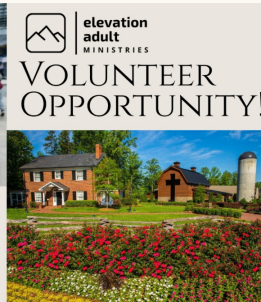
Tuesday: Visit The Billy Graham Library/Museum before returning home