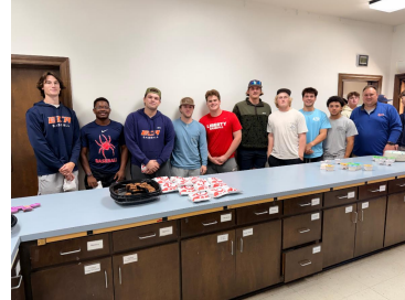
ECA Baseball Academy