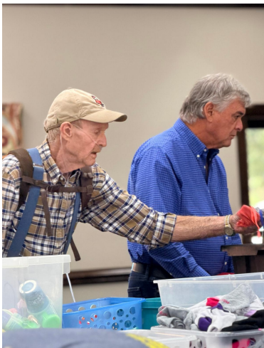
Sunday School Classes/Individuals