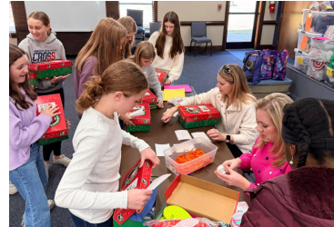
WCS Beta Club