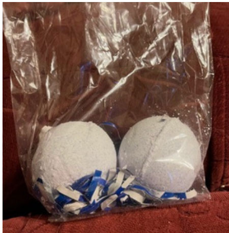
June 2nd Laura Bath Bomb