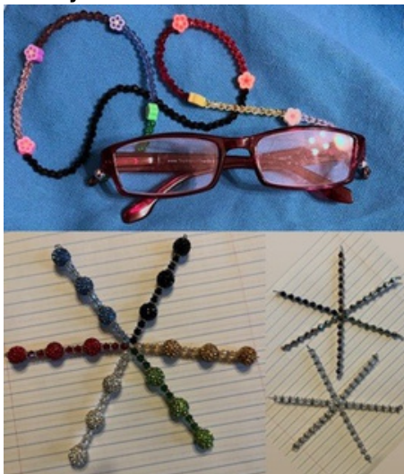
May 5th Stephanie Eyeglass Lanyard & Crystal Snowflake