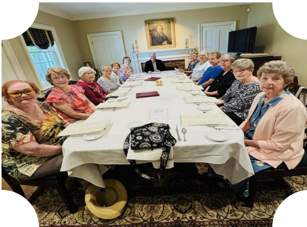
The Members of Rachel Circle and their Guests.