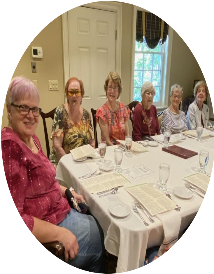
Rachel Circle Ladies/Guests