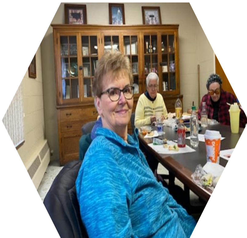
RACHEL CIRCLE LADIES