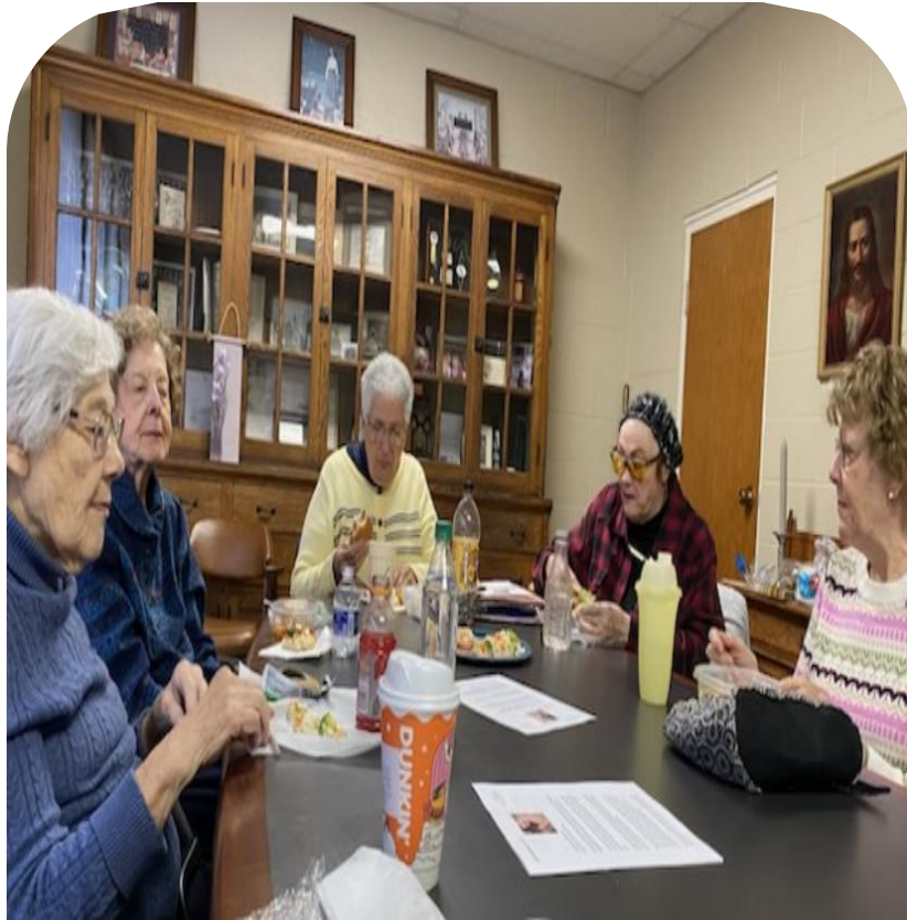
RACHEL CIRCLE LADIES