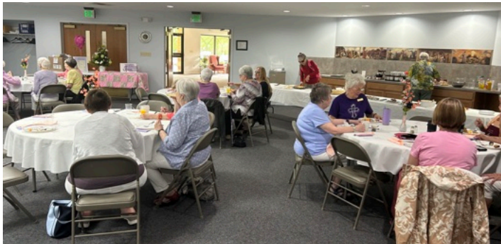
May Ladies Guild Prayer Breakfast