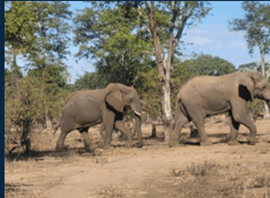
Elephants in Mosi-oa-Tunya National Park in Livingstone, Zambia