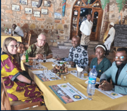
Lunch with family after Sunday worship in Lubumbashi, Democratic Republic of Congo