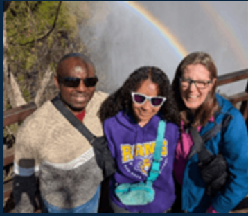
Double rainbows on the Zambia side of Victoria Falls!