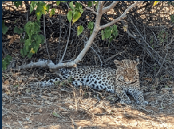
A leopard resting after killing an impala in Mosi-oa-Tunya National Park in Livingstone, Zambia