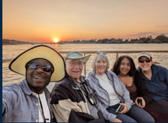
Sunset cruise on the Zambezi River in Livingstone, Zambia