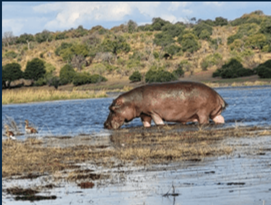
A hippo emerging from the waters of the lake in Chobe National Park in Botswana