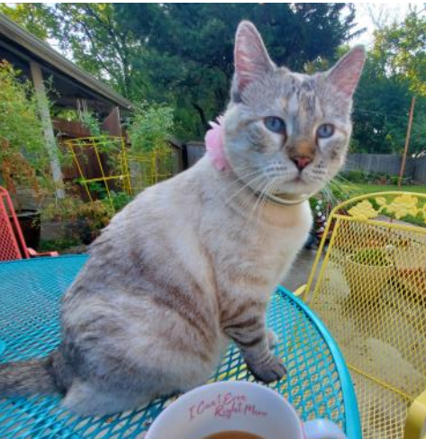
Hello from Penny Lumry! I was blessed!