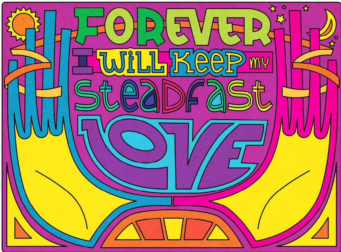
Psalm 89:20-37 • illustratedministry.com