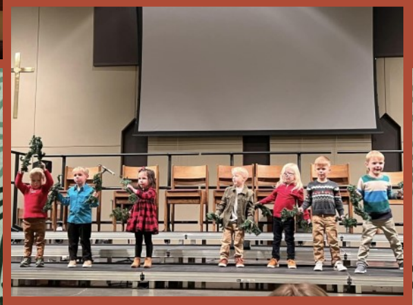
(Above) Students show off their moves at the TCCVG Christmas Program.