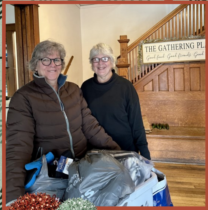
(Below) Members of the Brunch Team prepare treats for Brunch Sunday.