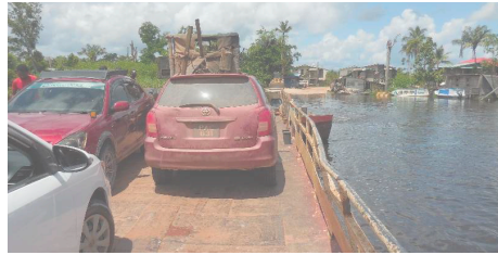
Crossing to Mt. Olivet Lutheran, Kwakwani.