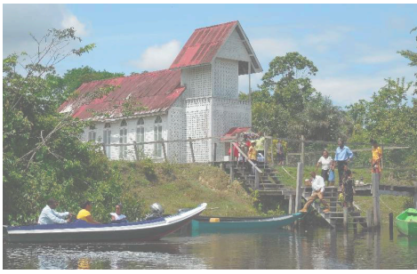
Reformation Lutheran, Kimbia, "parking lot"