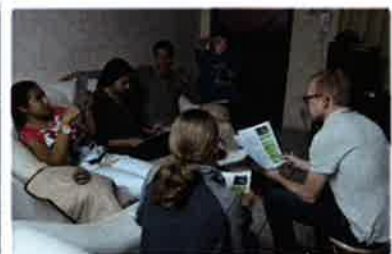
Leading Proxy Training