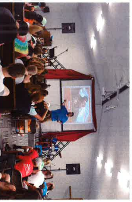
High School group hearing from one of our excellent missionary speakers