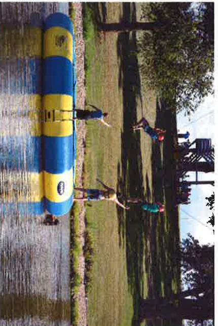
When riding the zip line at summer camp you can sometimes give a high five to someone on the water trampoline below