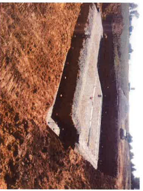
We broke ground on a new full-time staff residence in August