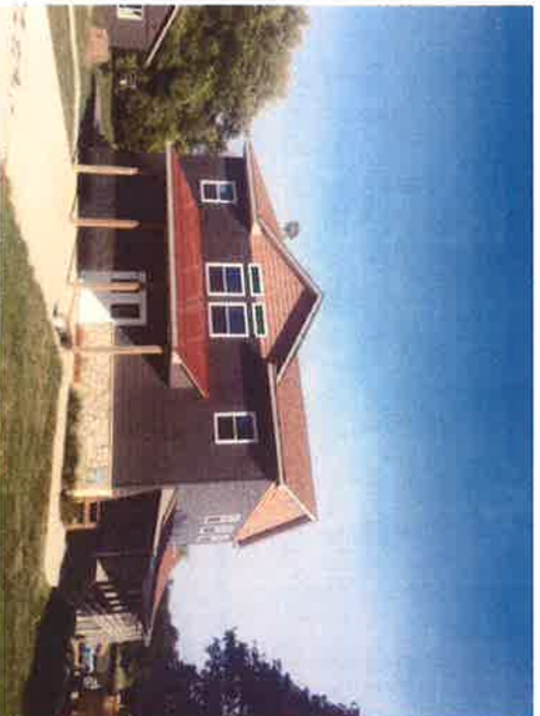
3840 sq. ft. chapel addition that is nearly 100% completed