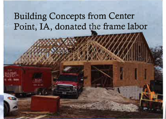
Building Concepts from Center Point, IA, donated the frame labor