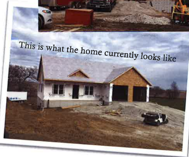
This is what the home currently looks like

I hope you have a wonderful Christmas celebration and a great beginning to 2018! We eagerly anticipate the beginning of our 74th year reaching campers with the saving message of Jesus Christ! As we anticipate 2018, would you please consider making a financial contribution to EIBC as we finish out 2017?