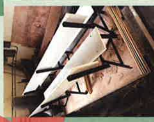
The new church benches!