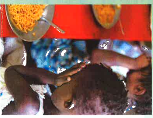
Saying grace before a breakfast favorite, spaghetti.

October brought some difficult news from the Haitian government regarding the future of orphanages in Haiti. However, we want you our supporters to be aware that we are working with the government to come to a happy conclusion for the future of EGO. Be aware that we are working diligently with the government with the reunification of children who have families who can now sustain them and with the new "Palms of Victory Homes" that will be coming available in 2019, here at EGO, to be family style homes for those who cannot be reunified with families. All of this takes time and many resources, but thanks to you our faithful followers and prayer warriors we are starting to see a light at the end of the tunnel. Please continue to hold EGO up in your daily prayers; especially during this transition time for Haiti. We all know that with growing pains comes many issues and those issues do not always have easy answers.