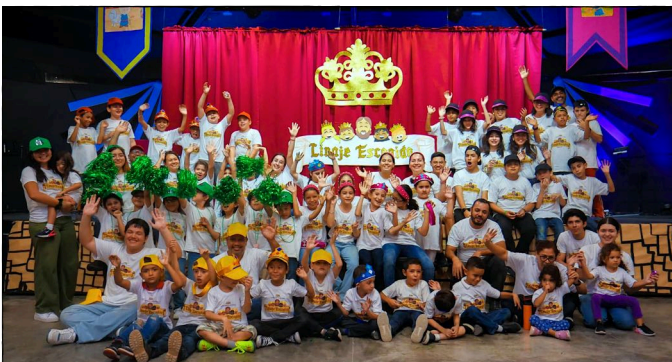
This year's camp attendees and their group leaders. Each group has distinctive hats, pompoms or scarves.

The Kid's Camp is always a great time. This year's theme was "Chosen Generation". The future belongs