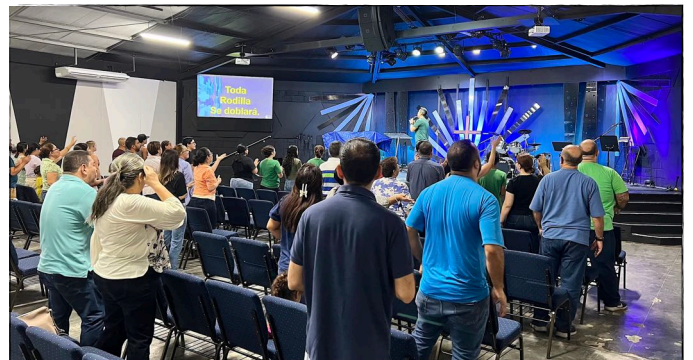
The second and third year discipleship classes meet together each week before breaking out into their small classes.