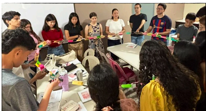
Part of the youth discipleship missions course is learning about the major religious blocs and how to pray for unreached people.

make a set of three studies designed to help mobilize local churches to significant participation in global mission. Each of these three courses ends with a special session of reflection on what was learned and writing out an Action Commitment with next steps toward a life on mission.