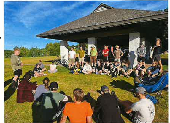
Our students met last night to pray and make plans to reach out to freshmen this week