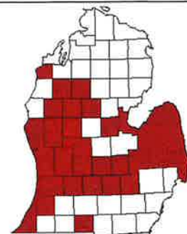
RTF counties in Michigan

Mail: 1480 Buchanan Ave SW Grand Rapids, MI 49507