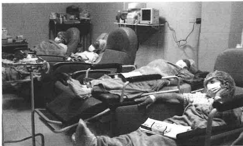
Eight U.S. volunteers restored sight to patients who urgently needed cataract

Because of compassionate doctors, dedicated volunteers, and the generosity of donors, 123 people received the gift of vision—and a new beginning.