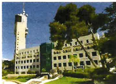
The Rothberg School of Hebrew University