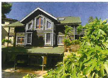
The JCBT dormitory, library and classroom