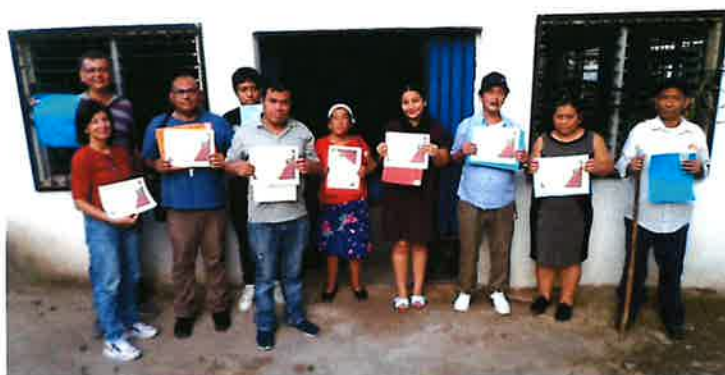
These are folk showing off their Certificates of Completion of the trainings. The building is of a new church plant that has been underway for several years.