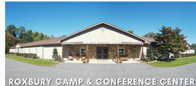
ROXBURY CAMP & CONFERENCE CENTER