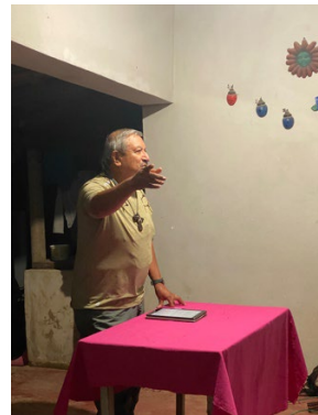
Day 2 Friday Children's program