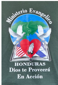
Day 1 Thursday