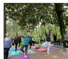
yoga at the retreat in 2021