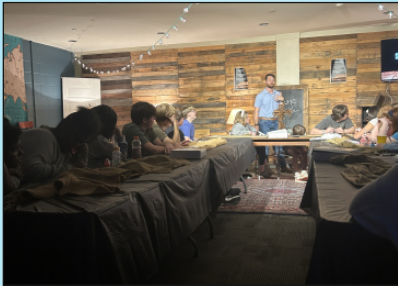
During Lent, our youth are taking part in a Table Talk series.