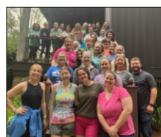
last year's Women's Retreat