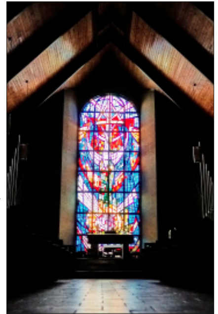
Sanctuary window

In September of 1978, the congregation of Parkway Heights United Methodist Church worshiped for the first time in its newly constructed Sanctuary. One of the distinctive focal points of the new worship space was the dramatic stained glass window in the north side of the room. The window is a contemporary design which soars more than 30 feet on the wall behind the communion table. During the long course of planning and implementing the construction of the Sanctuary, one of the many responsibilities of the building committee was to select the window design. The committee met several times with an art representative from the L.L. Sams Company of Waco, Texas, and had seen numerous window designs, but none of them seemed to be the right choice for Parkway Heights. One day, while looking through a catalogue at selections of light fixtures for the Sanctuary, the minister saw a window pictured on the cover. It was rich in symbolism, created with vivid, intense colors; and he felt immediately that it might be the right choice. The Sams Company confirmed that they could produce the design, and the committee quickly reached consensus in adopting the design.