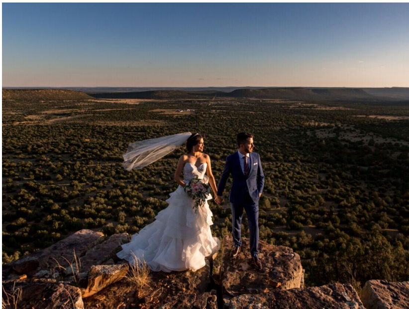
Blame Her Ranch

Forty-five minutes from Santa Fe, you'll find Blame Her Ranch —a luxury ranch with a 7,900-square-foot main lodge home that sleeps up to 24. The gorgeous property is also home to an 18,000-square-foot great lawn that can become the scene of your outdoor wedding. Two other wedding spaces include a 1,750-square-foot converted party barn (it's a lovely rehearsal dinner spot) and a 1,500-square-foot covered gazebo. Back to the main lodge, it's really a knockout feature. Fit with a great room with a 28-foot stone fireplace, a game room, a home theater, an outdoor patio kitchen, a gym, an office and so much more, it's perfect for a family-friendly wedding weekend. Oh, and there's an outdoor pool for even more fun.