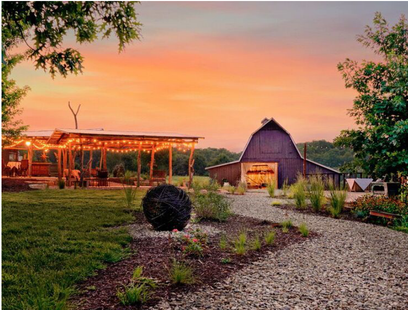
Circle S Ranch & Country Inn

Circle S Ranch & Country Inn is located in the Midwest, in Lawrence, Kansas. Saying "I do" here means saying "I do" at a charming pastoral location steeped in history: The venue was established in 1860 and has been a working ranch for six generations. For your wedding day at Circle S, you'll have your choice of outdoor ceremony sites or the indoor wedding chapel, and your reception will take place in the 3,000-square-foot party barn or the Inn's great room. There's also an on-site bed and breakfast for overnight guests. Regarding pricing, Circle S offers three different wedding packages—Modern Ranch, Elegant Country and Rustic Luxury—so you can choose what works best for your needs and vision.