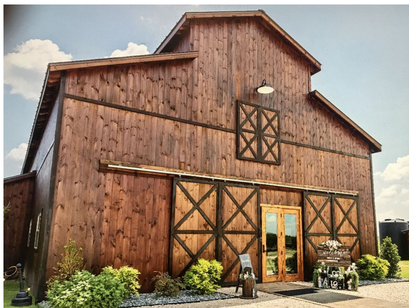
Texas RoadRunner Ranch

Head to Ferris, Texas, and you'll find the Texas Roadrunner Ranch . (It's also a short drive from Downtown Dallas.) Even if you're from the area, Texas RoadRunner refers to itself as a destination wedding venue and a romantic getaway. The family-run establishment has all the makings of a lovely ranch wedding venue, such as 100-plus acres of rolling hills, a rustic-chic venue barn, green pastures, a biergarten pavilion perfect for an outdoor wedding under the stars and a "Floating" Veranda fit for a romantic wedding ceremony on an island in the middle of a large pond.