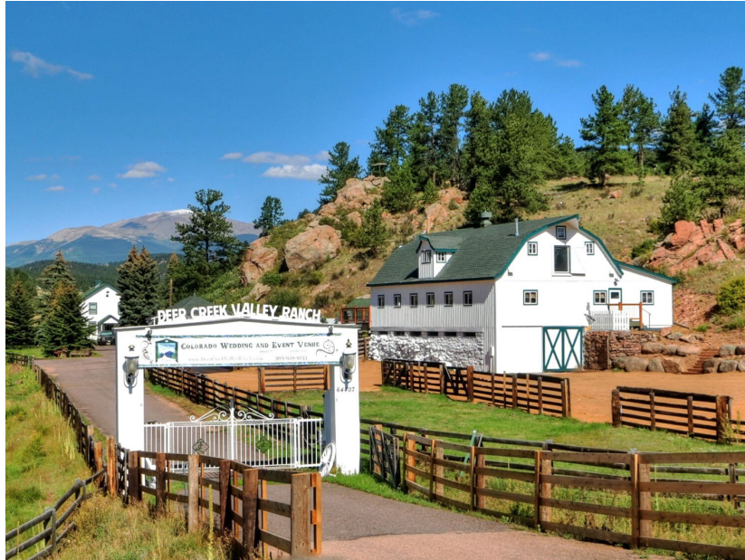
Deer Creek Valley Ranch

Back in Colorado is Deer Creek Valley Ranch , a much-loved and award-winning family-run establishment, ranch and barn wedding venue located 45 minutes from Denver. The special events venue was inspired by the owners' own love story, and the on-site barn was originally built in 1862. Accommodating up to 180 guests, Deer Creek Valley ranch offers both venue package pricing and all-inclusive package pricing. The venue also offers three outdoor ceremony spaces (Pine Cathedral, Mountain Bridge Meadow, Lakeside Gazebo) and three cocktail hour sites (Duke's Terrace & Hearth, Fireside Patio, Gazebo Game Site). There's also the elegant Homestead Tent Ballroom for your reception.