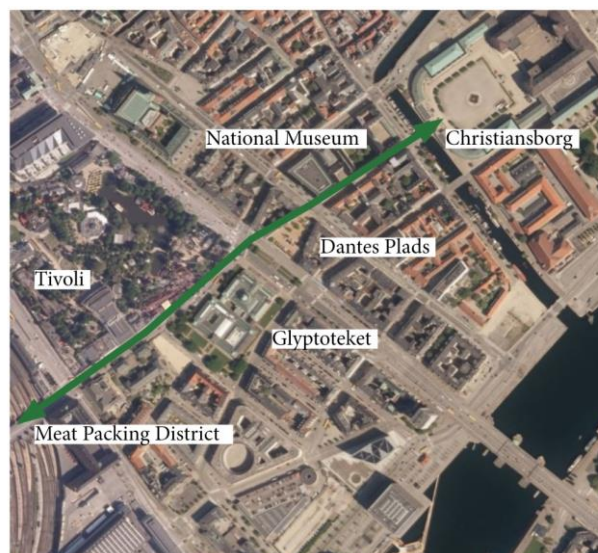
Figure 4: The green line indicating the 'Culture axis' from 'Christiansborg' to the 'Meat Packing District'.

Dantes Plads was redesigned by GHB Landscape architects in cooperation with COBE architects and the consultancy company Grontmij. One of the core issues in the program for the future design of Dantes Plads was to maintain the number of parking spaces. Furthermore, it was a great wish to maintain the culture-axis which goes from the parliament building 'Christiansborg' to the 'Meat Packing District' (see figure 4). As far as possible, the architects wanted to save the existing trees while the geometry, colors and materials used had to relate to Glyptoteket (a museum with a collection of sculptures, see figure 3), which is the primary relation to Dantes Plads (Weeke Borup, 2014). The intention was to create a green space with a large variety of planting for the whole year. It had to be possible to sit in the sun and shade on traditional benches placed in the area. Natural walking lines had to ensure that the whole area would be used. The variation in the terrain had to provide secondary places to sit, lie, play or run. The waving terrain had to direct focus away from the parking spaces without making a dominant border between the two functions (Weeke Borup, 2014).