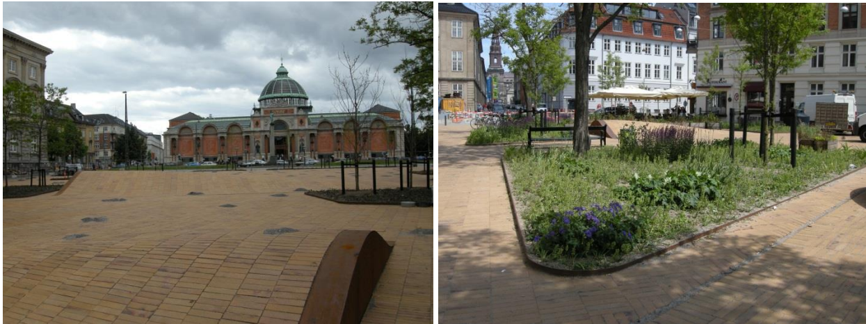
Figure 6 and 7: Dantes Plads after the redesign.