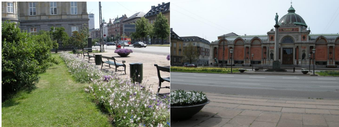
Figure 2 and 3: Photos of Dantes Plads before the redesign