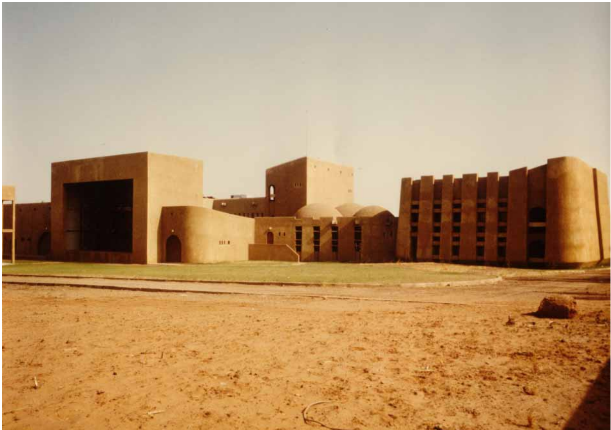
“ONERSOL” Solar Energy Research Centre, Niamey, Niger