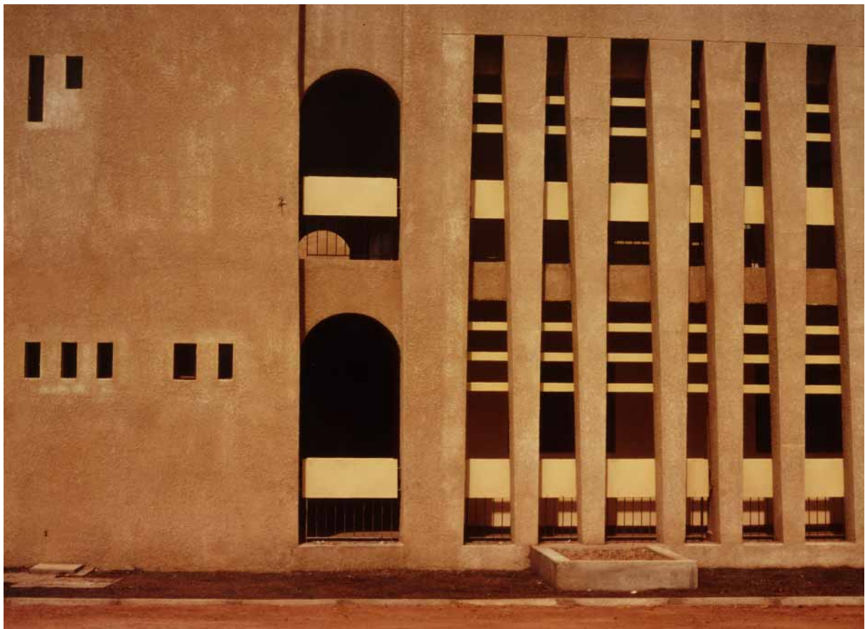
Offices and laboratories: detail of aeration