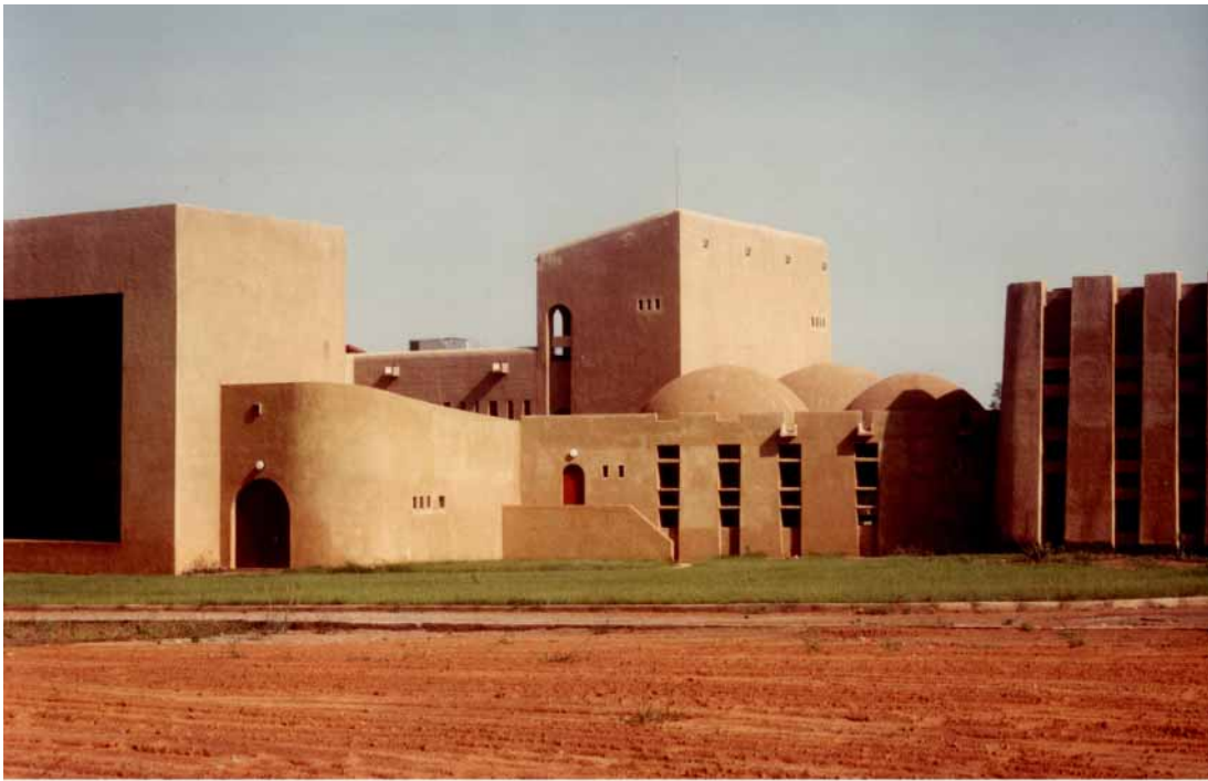
View of central core with 3 domes from the north