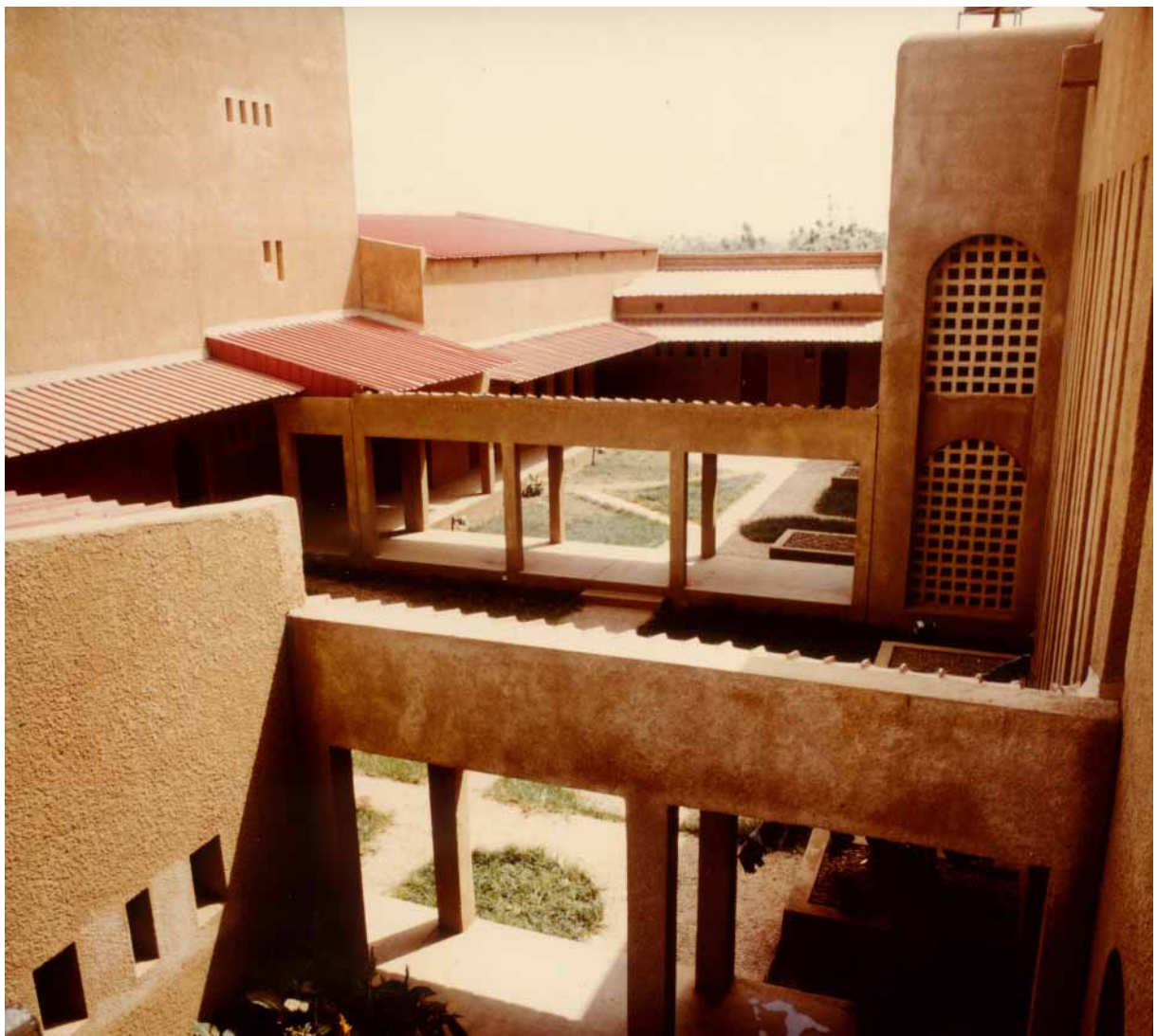
"ONERSOL" Solar Energy Research Centre, Niamey, Niger