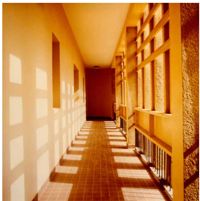
“ONERSOL” Solar Energy Research Centre, Niamey, Niger