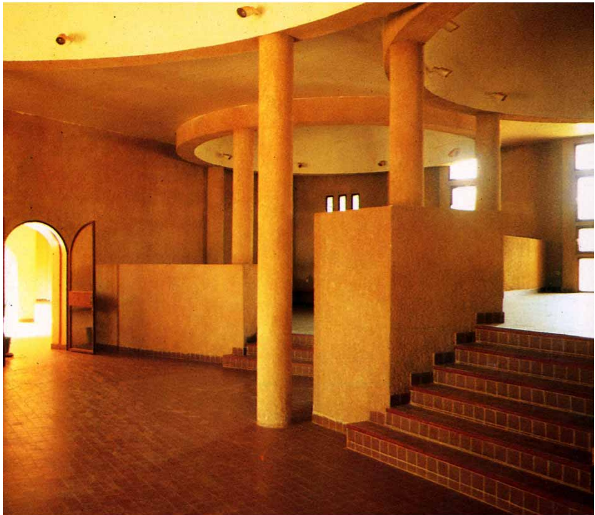
Domed spaces of the entrance hall. Cafeteria and lounge space at right