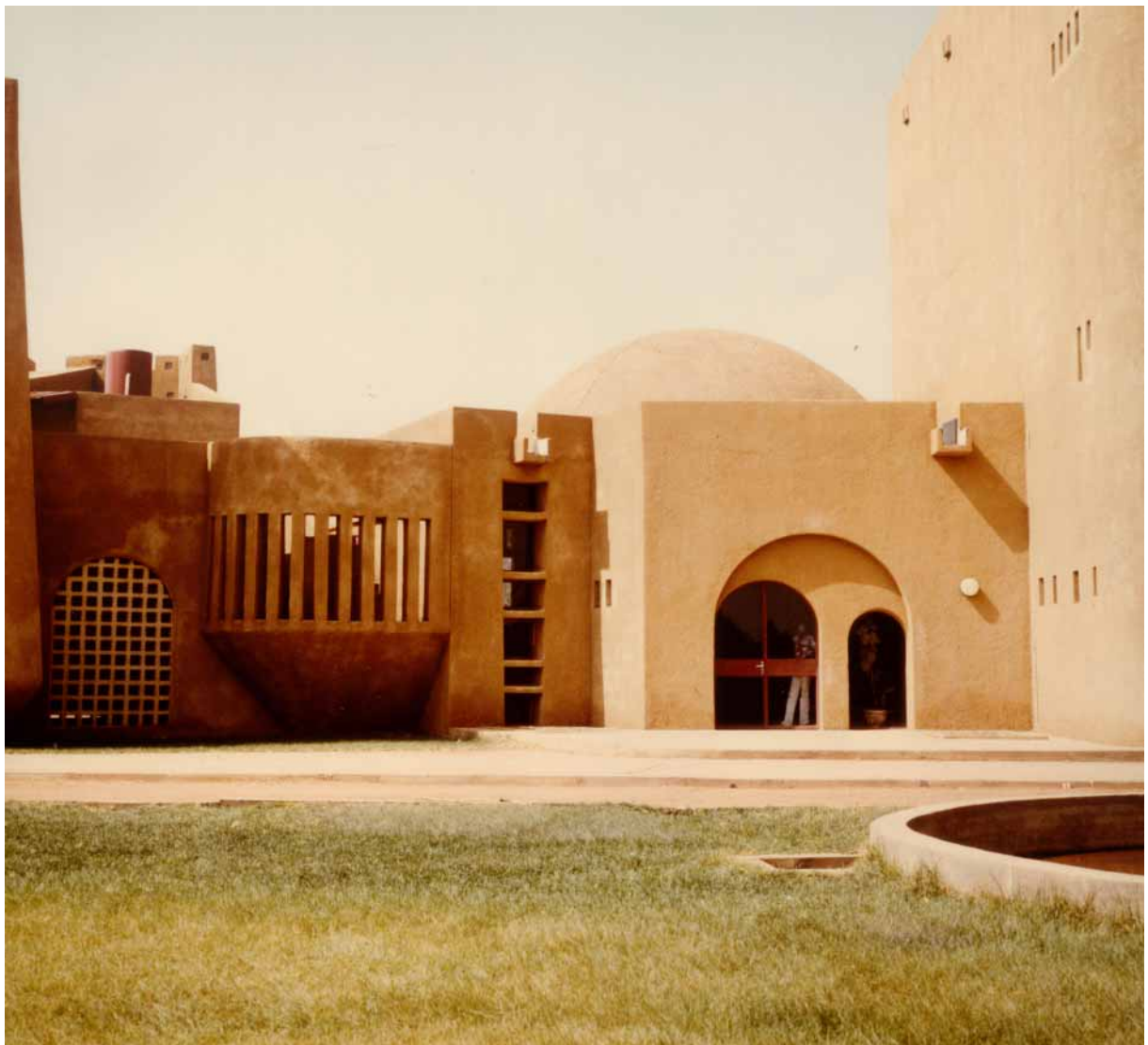
“ONERSOL” Solar Energy Research Centre, Niamey, Niger