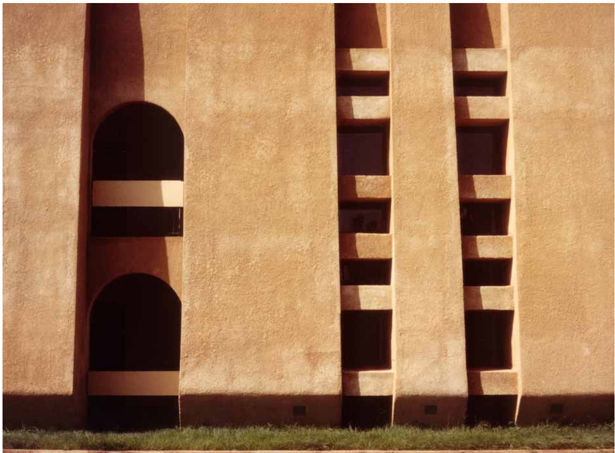
Detail of residential unit façade viewed from the south