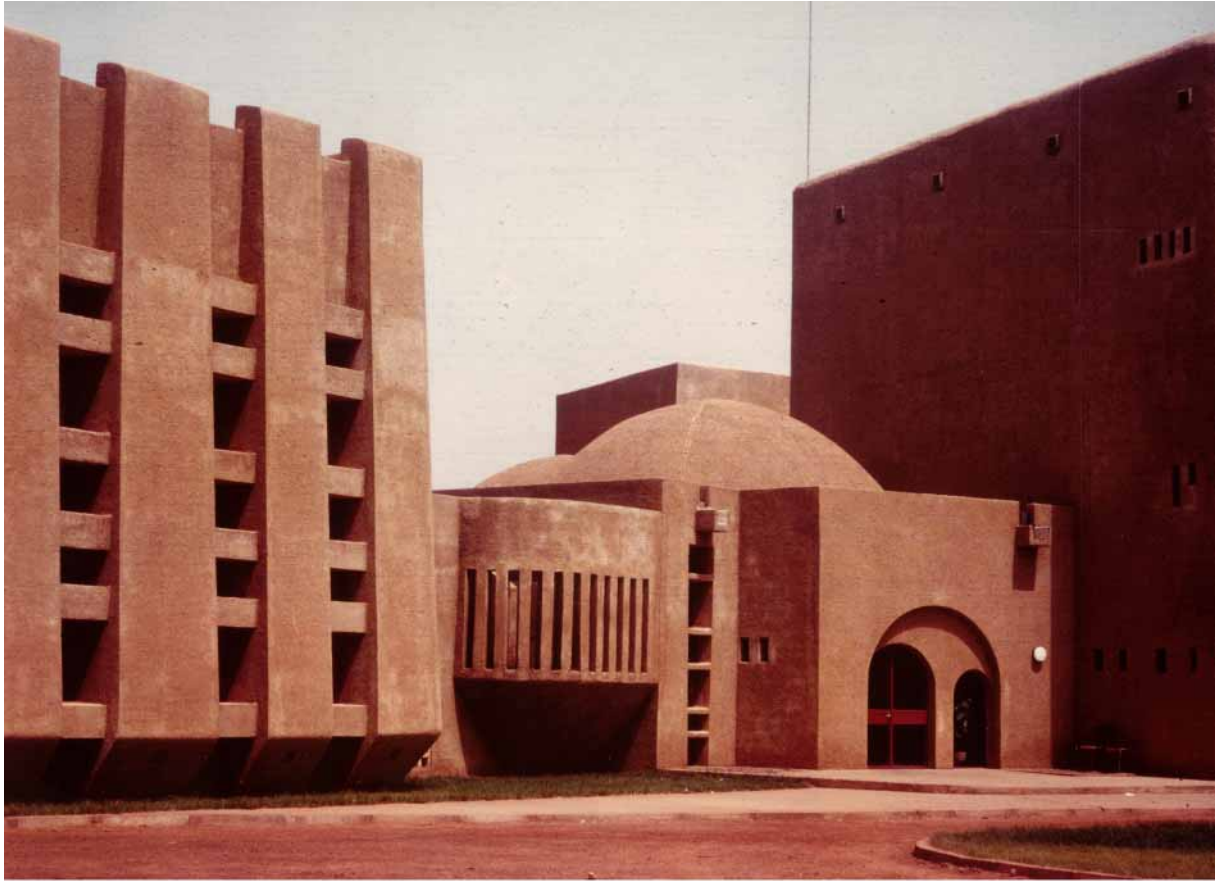
Central building with entrance to main hall