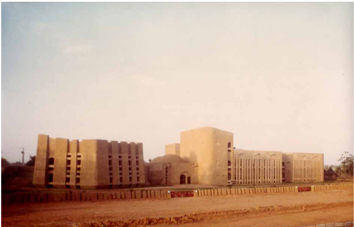
General view from south-west