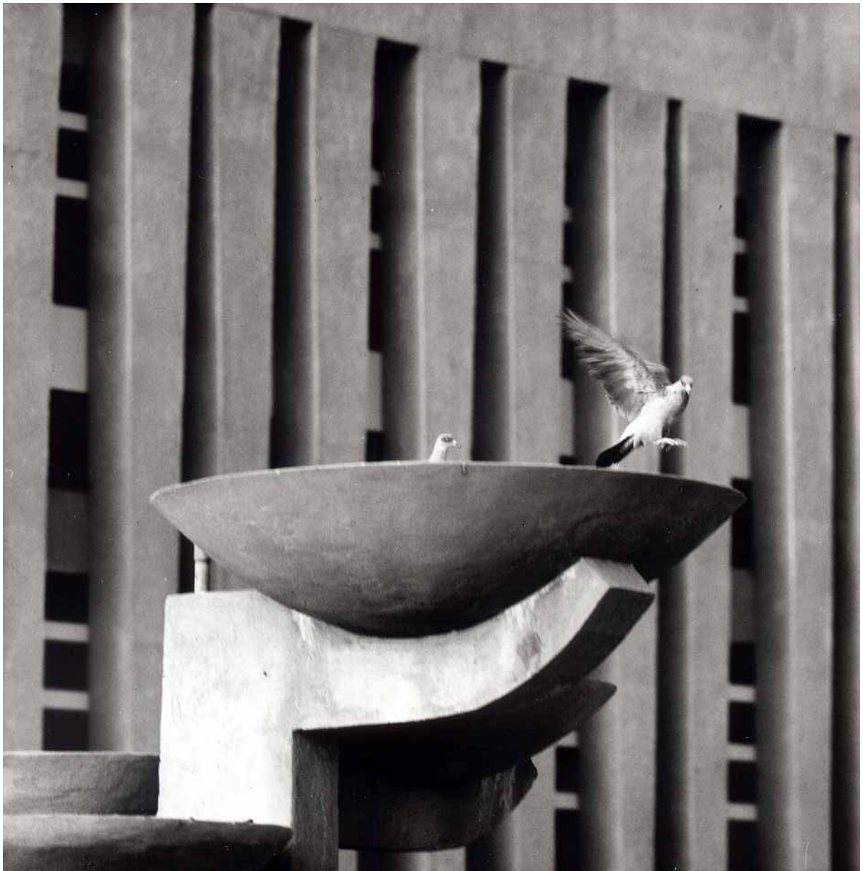
"ONERSOL" Solar Energy Research Centre, Niamey, Niger