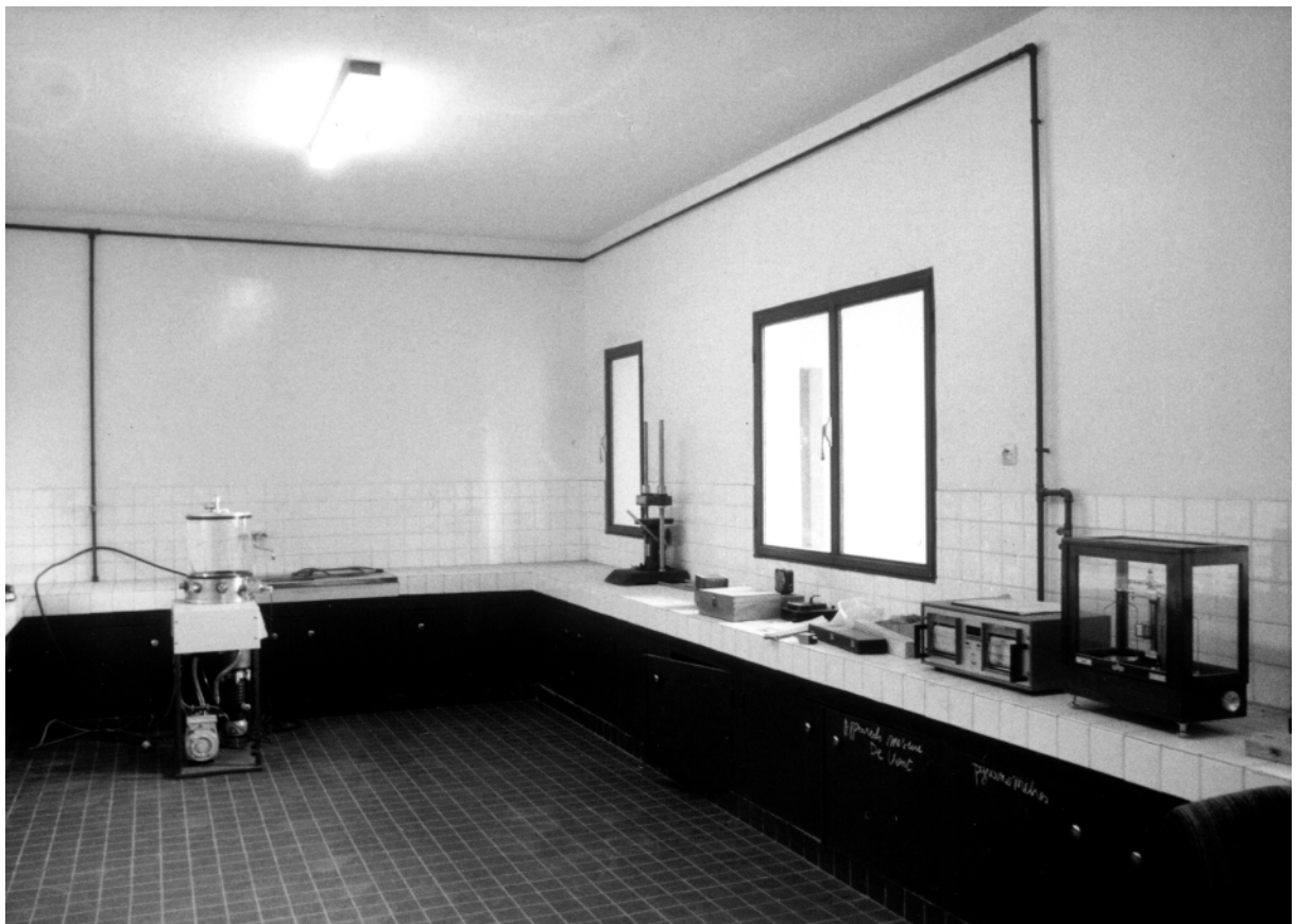
“ONERSOL” Solar Energy Research Centre, Niamey, Niger