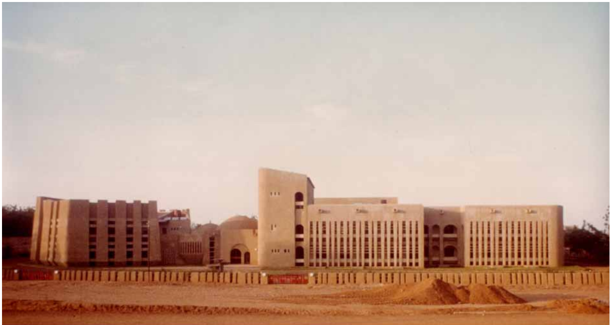
View from south: Residential units, General hall and laboratories