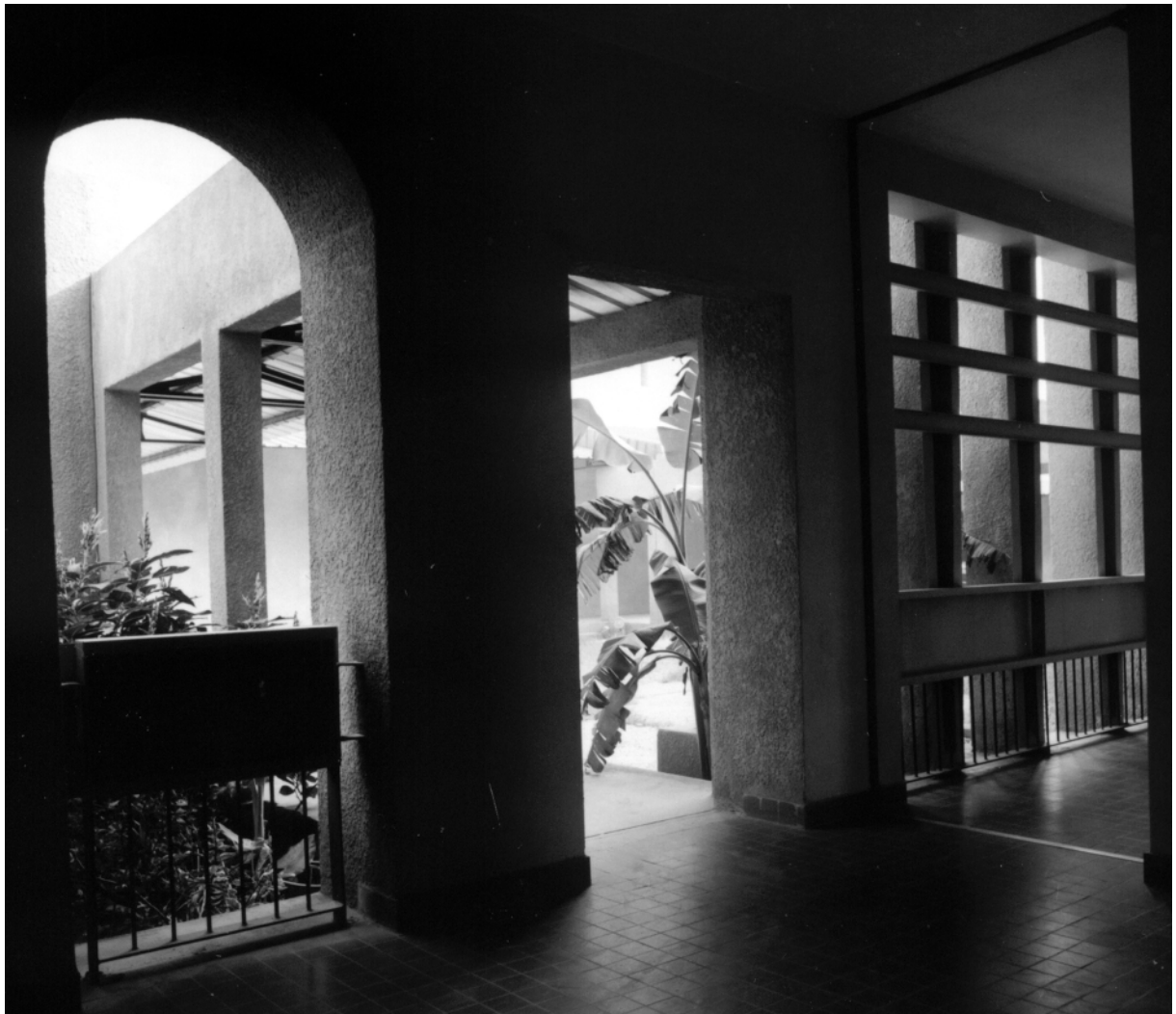
"ONERSOL" Solar Energy Research Centre, Niamey, Niger