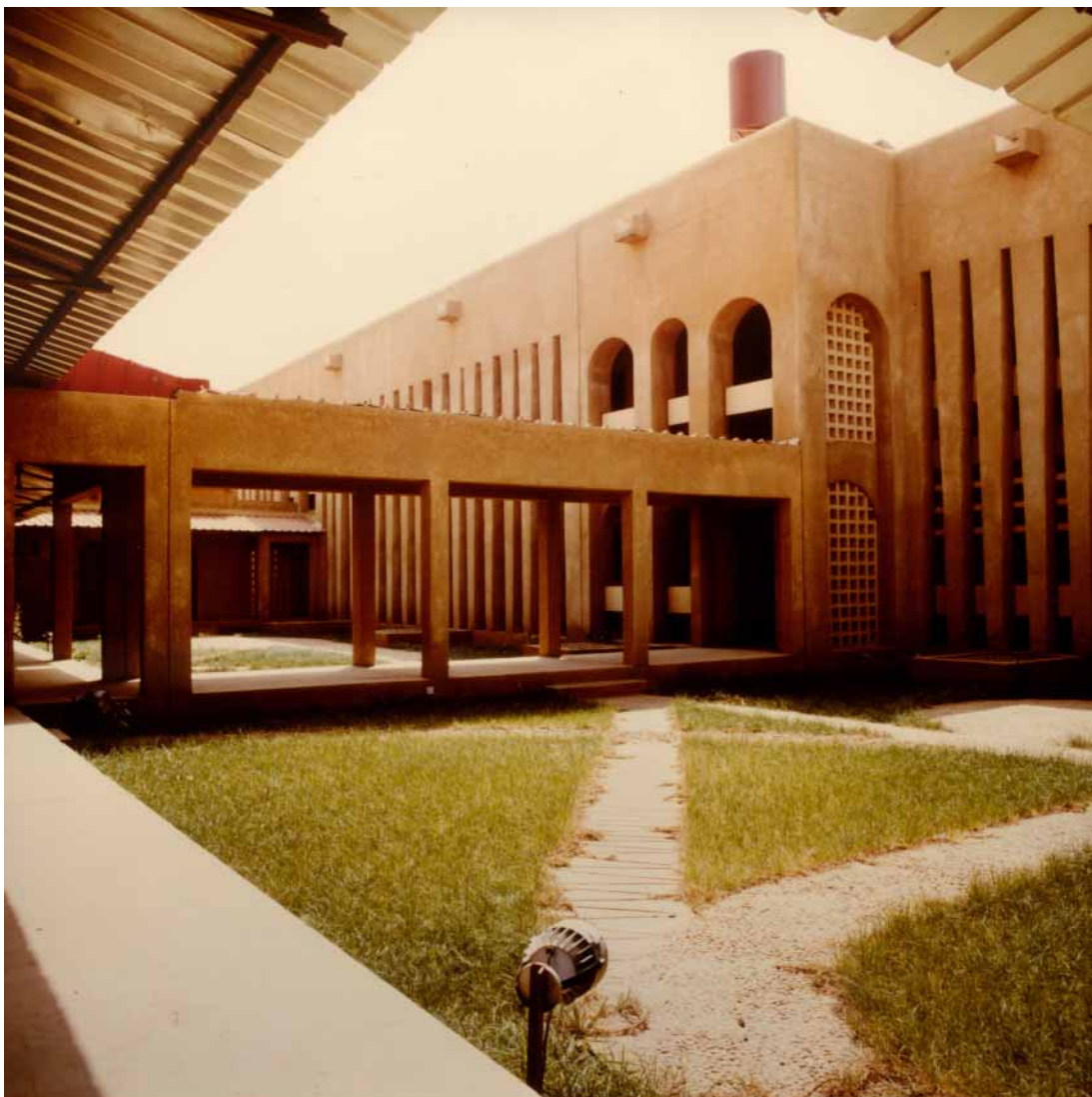
Patio surrounded by offices and laboratories