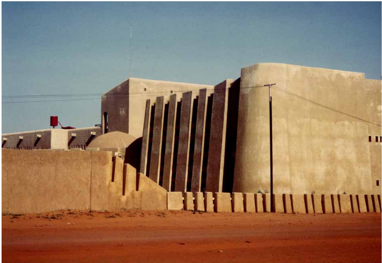
Residential units viewed from west