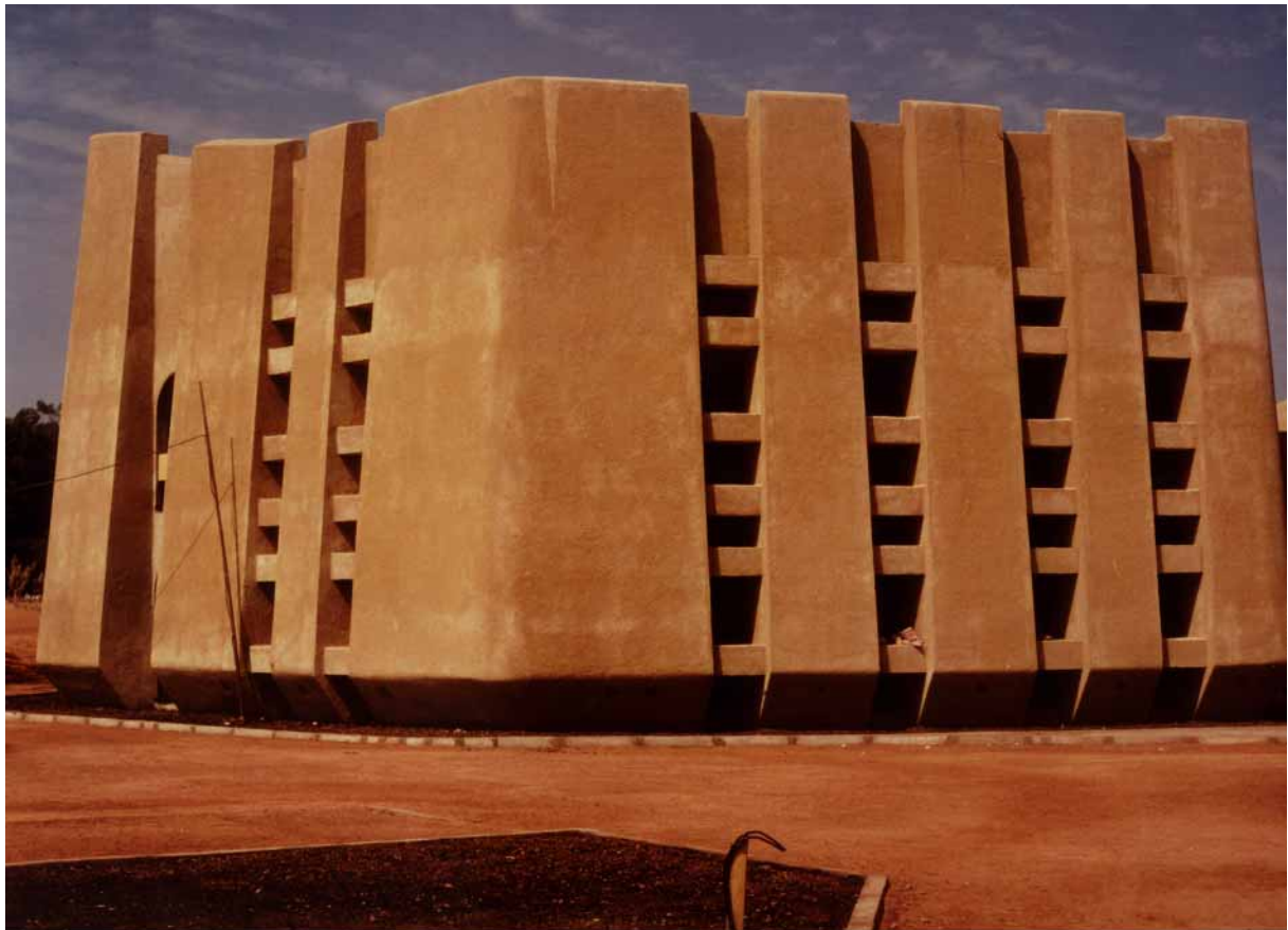
Residential units viewed from south