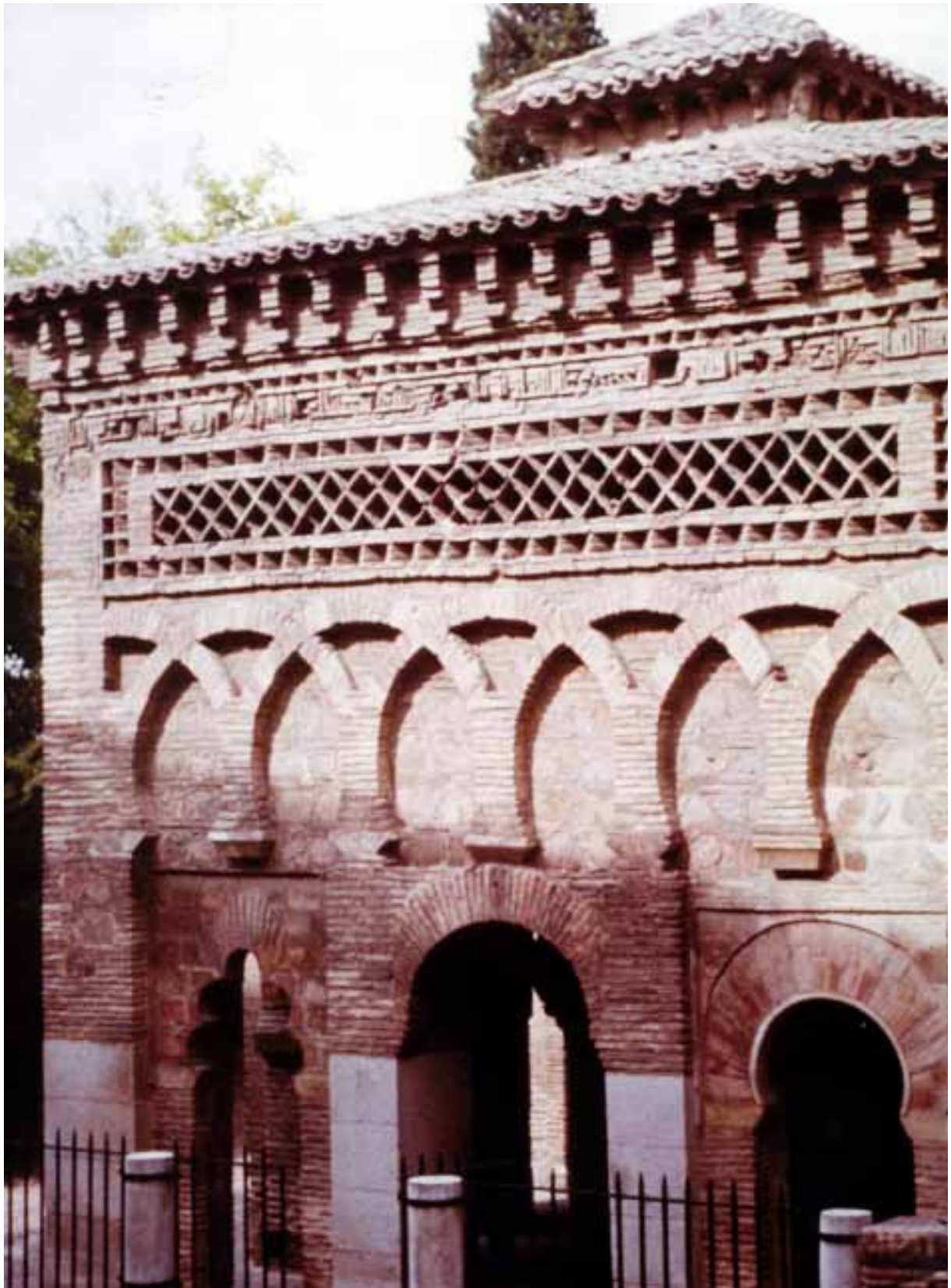
Bib-al-Mardom, entry façade; Brickwork calligraphy below cornice