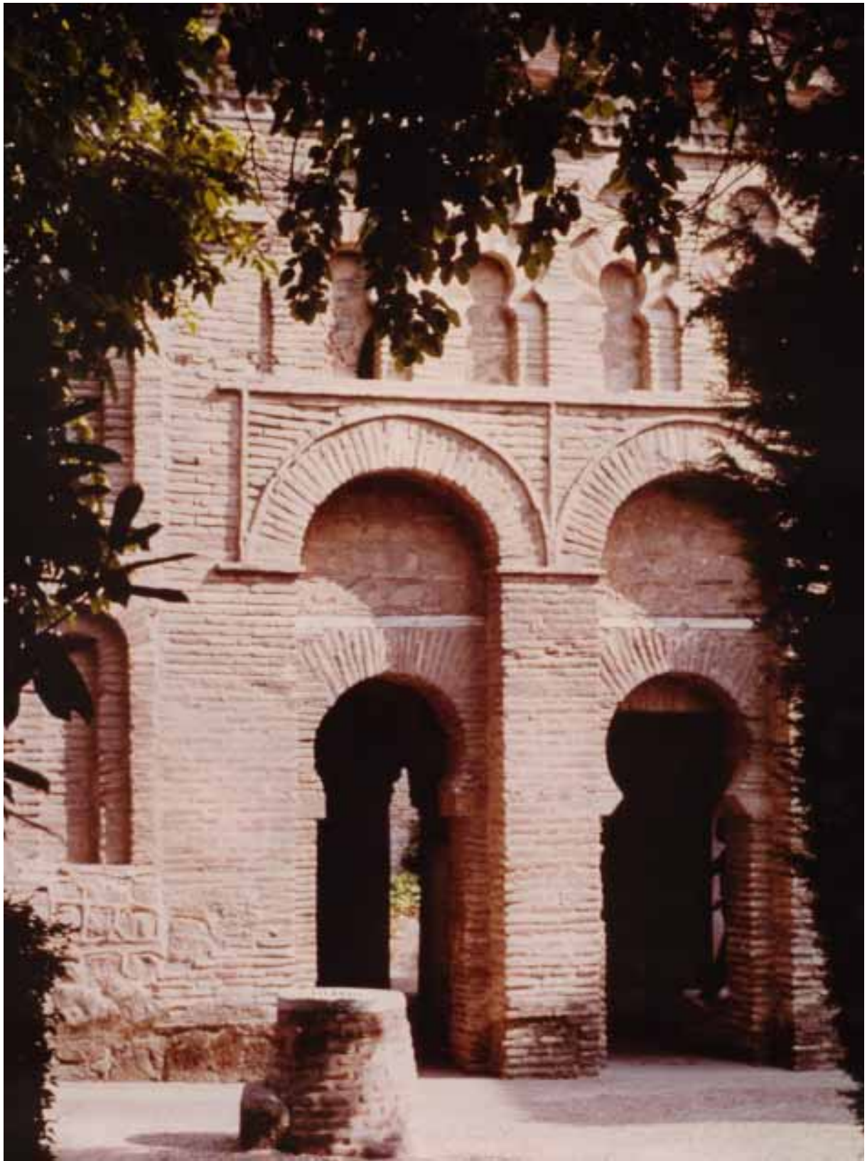
Bib-al-Mardom, North-West façade, after restoration of brickwork. Par left, joint between Christian apse and mosque