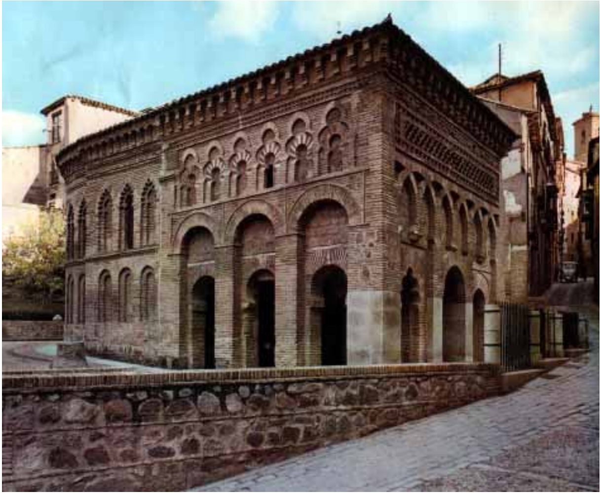
Bib-al-Mardom Mosque (Cristo della Luz); 14th capse behind original 9 square plan prayer hall