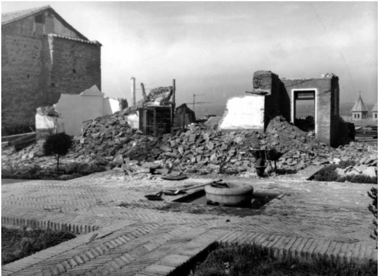
Demolition of existing house for landscaped mosque terrace