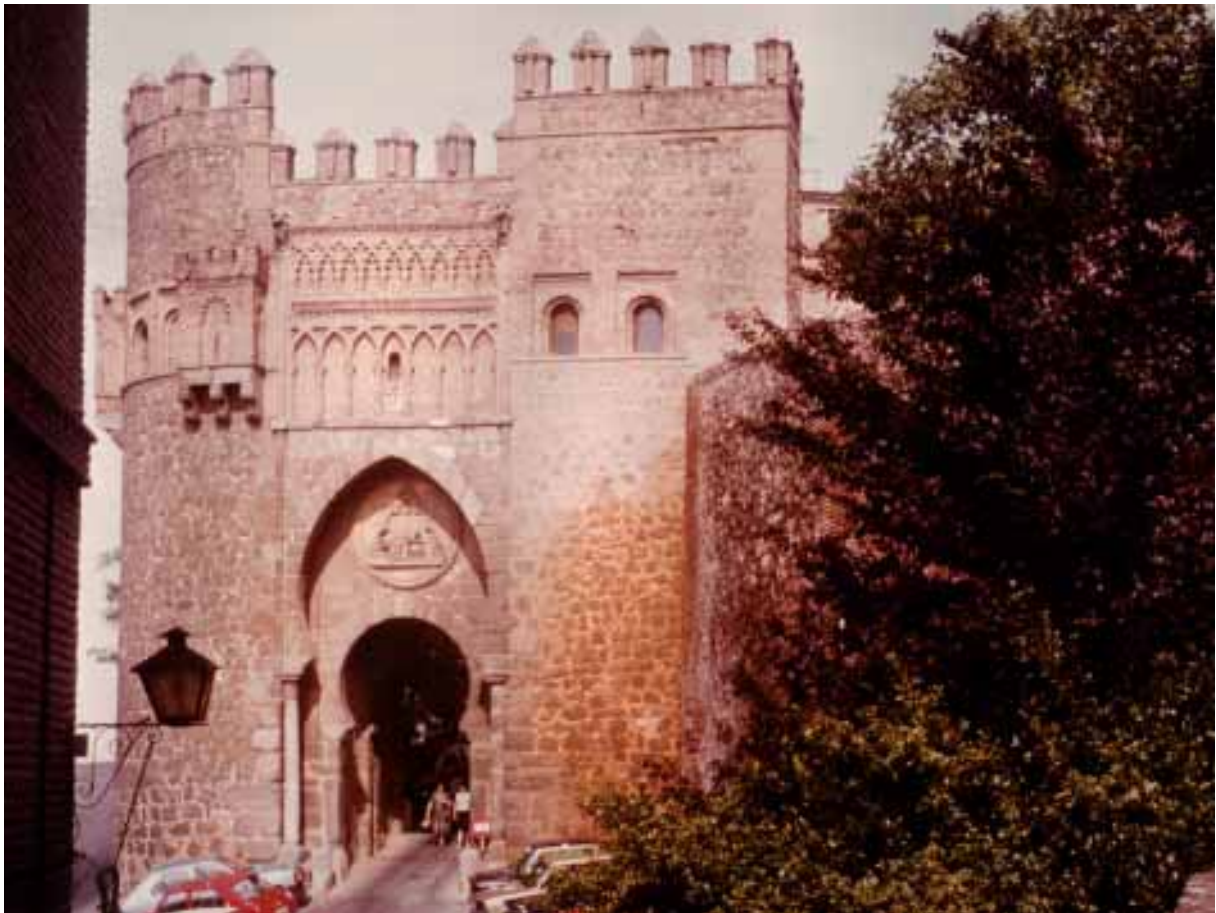
Puerta Del Sol, fortified gateway through old city ramparts, after restoration