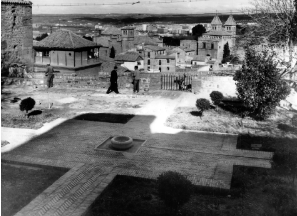
Terrace, nearing completion