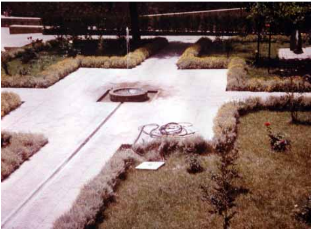
Terrace landscaped; new fountain