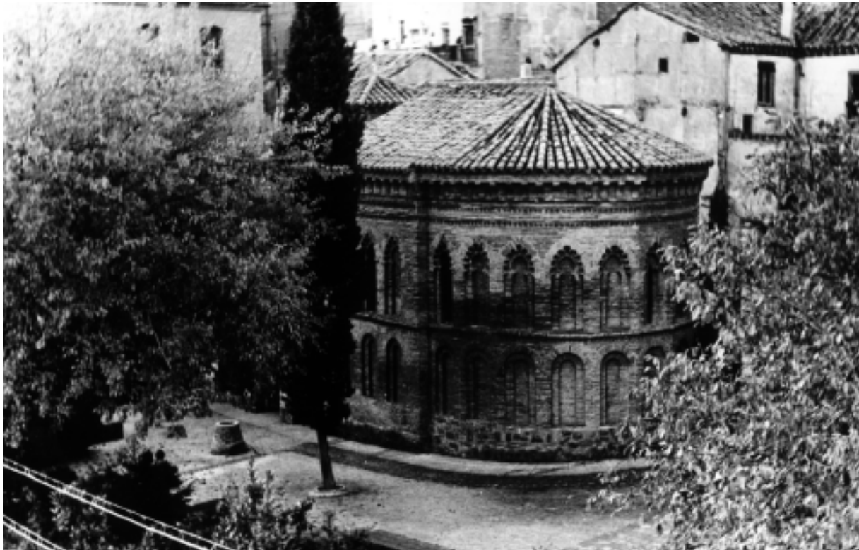
Apse adjoining mosque; view of landscaping and site context within Toledo's old city