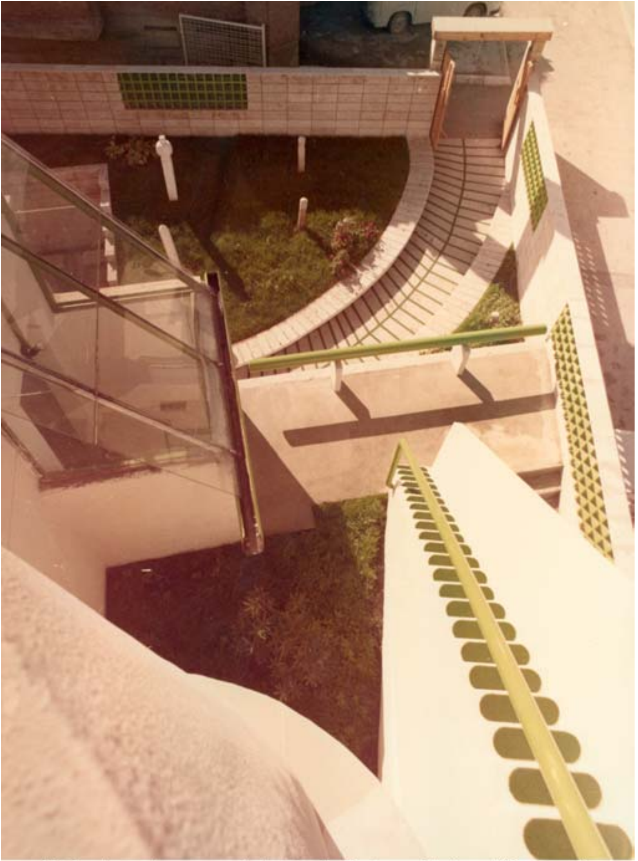
Main entrance to mosque (below) and stairs to small minaret (foreground)