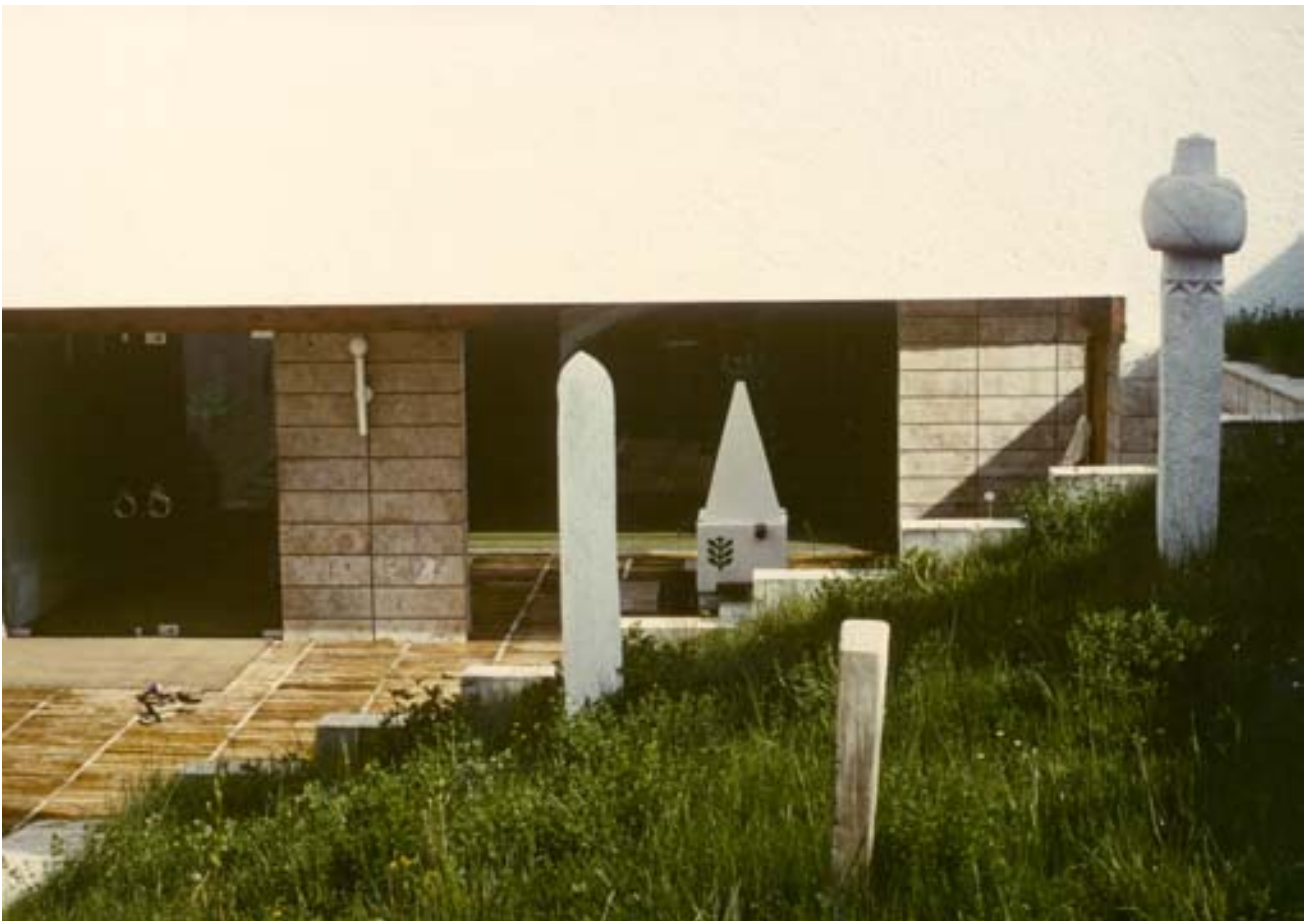
Sherefudin's White Mosque, Visoko, Bosnia-Herzegovina