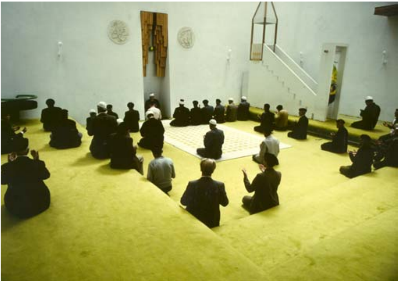
Sherefudin's White Mosque, Visoko, Bosnia-Herzegovina