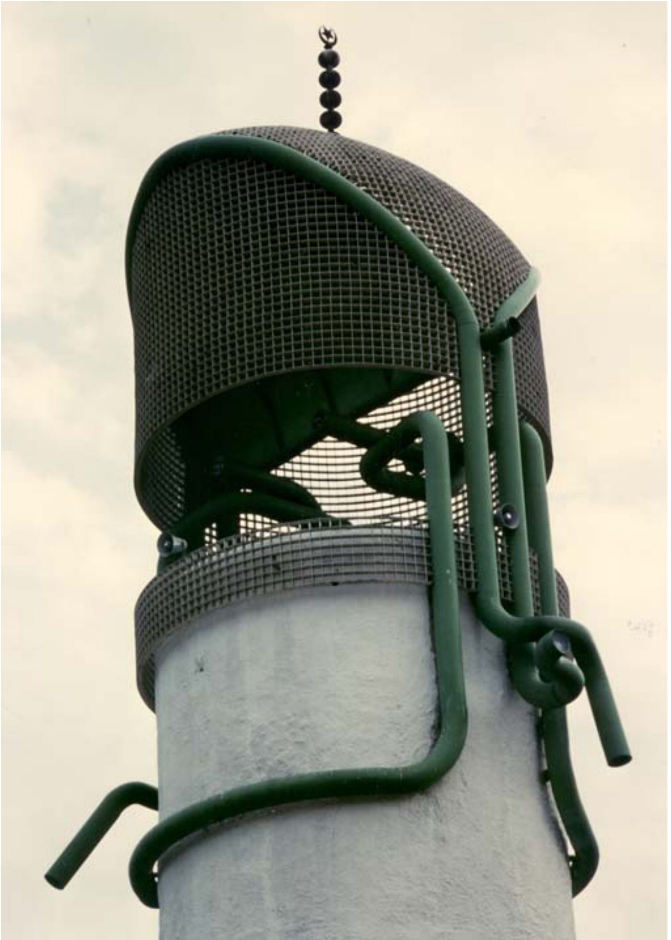
Sherefudin's White Mosque, Visoko, Bosnia-Herzegovina