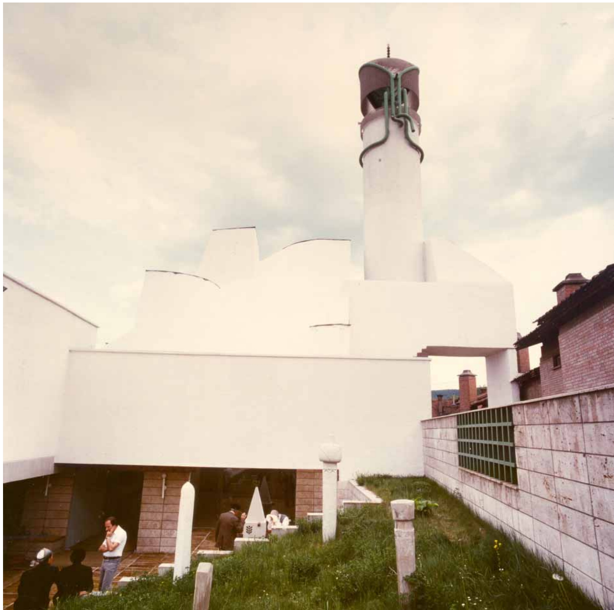
Sherefudin's White Mosque, Visoko, Yugoslavia