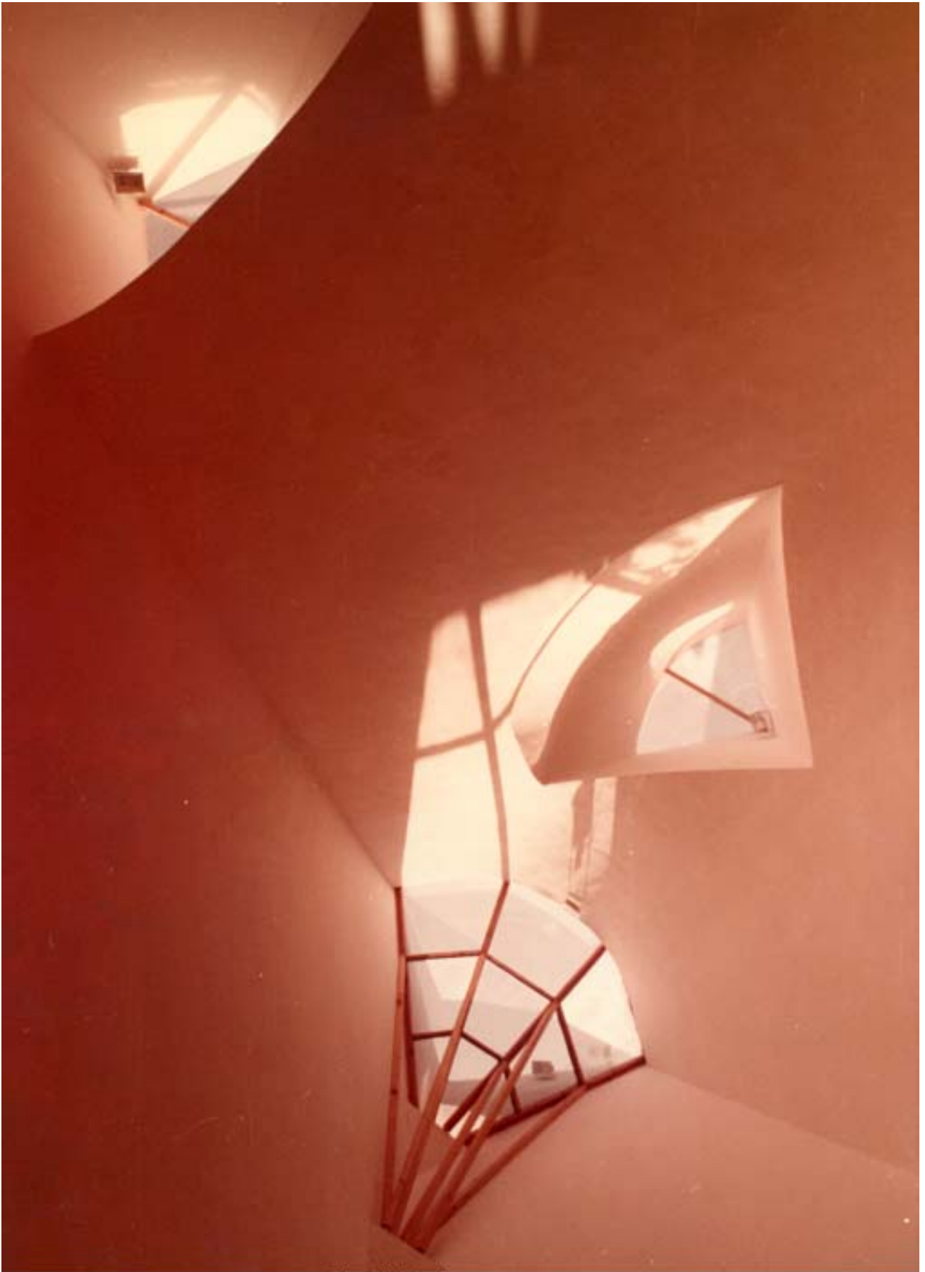
Sky-lights in prayer room