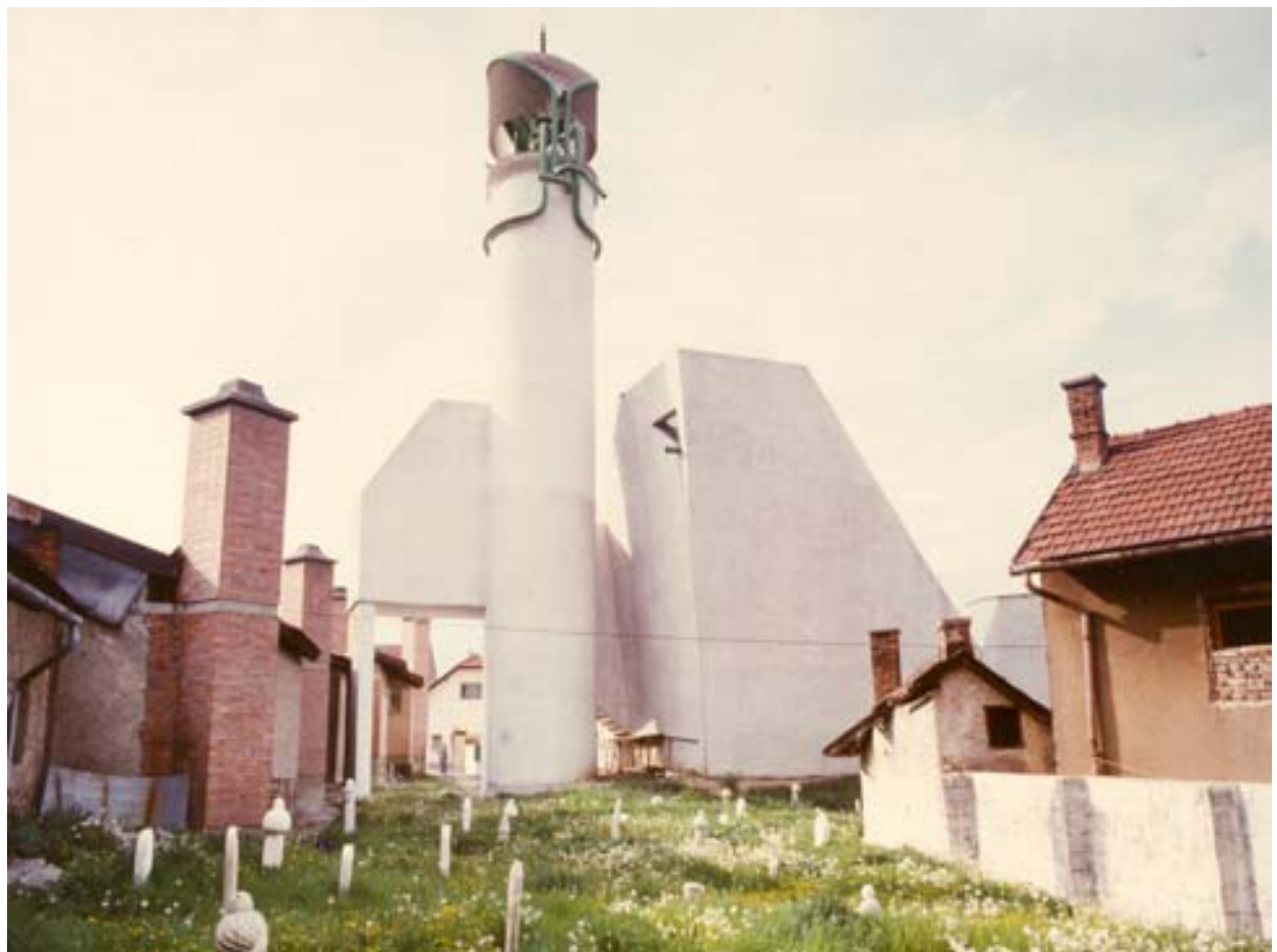
Sherefudin's White Mosque, Visoko, Bosnia-Herzegovina