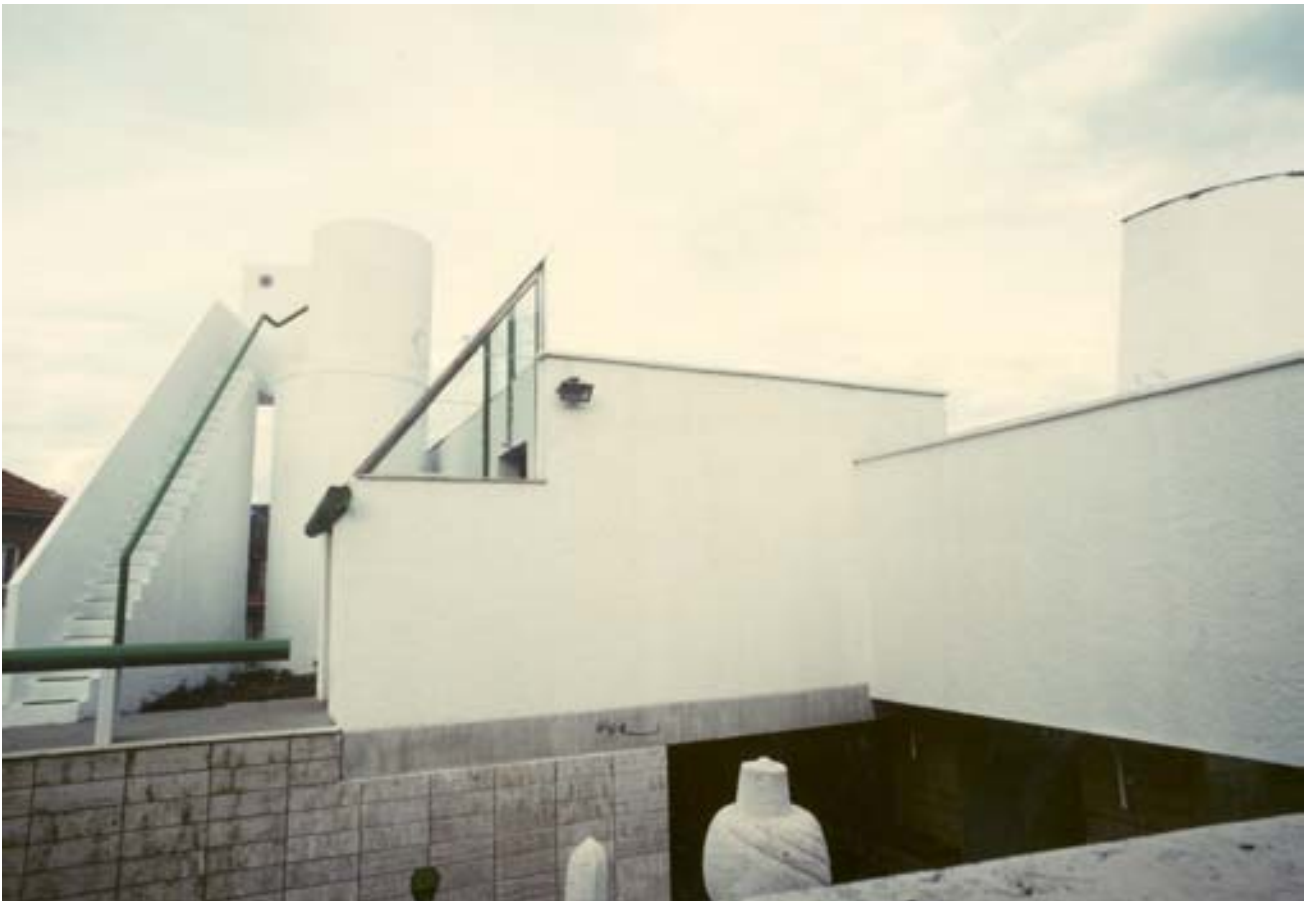
Sherefudin's White Mosque, Visoko, Bosnia-Herzegovina