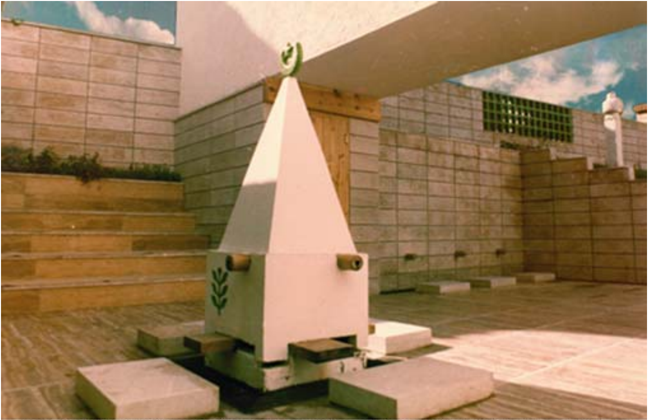
Courtyard at entrance to prayer room and sculptural ablution fountain