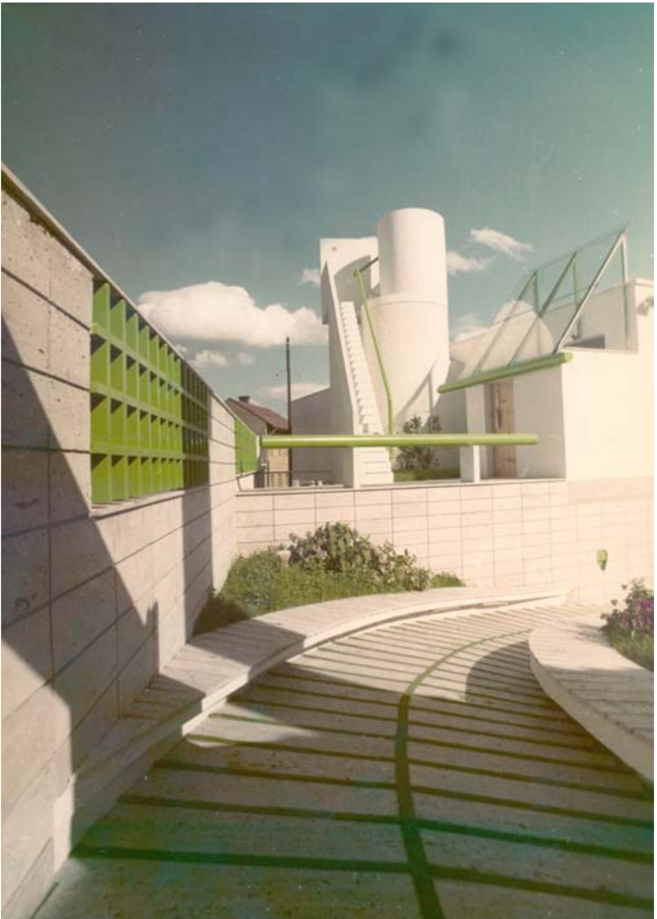
Entrance ramp (foreground), entrance to classroom and office (centre) and small minaret (background)