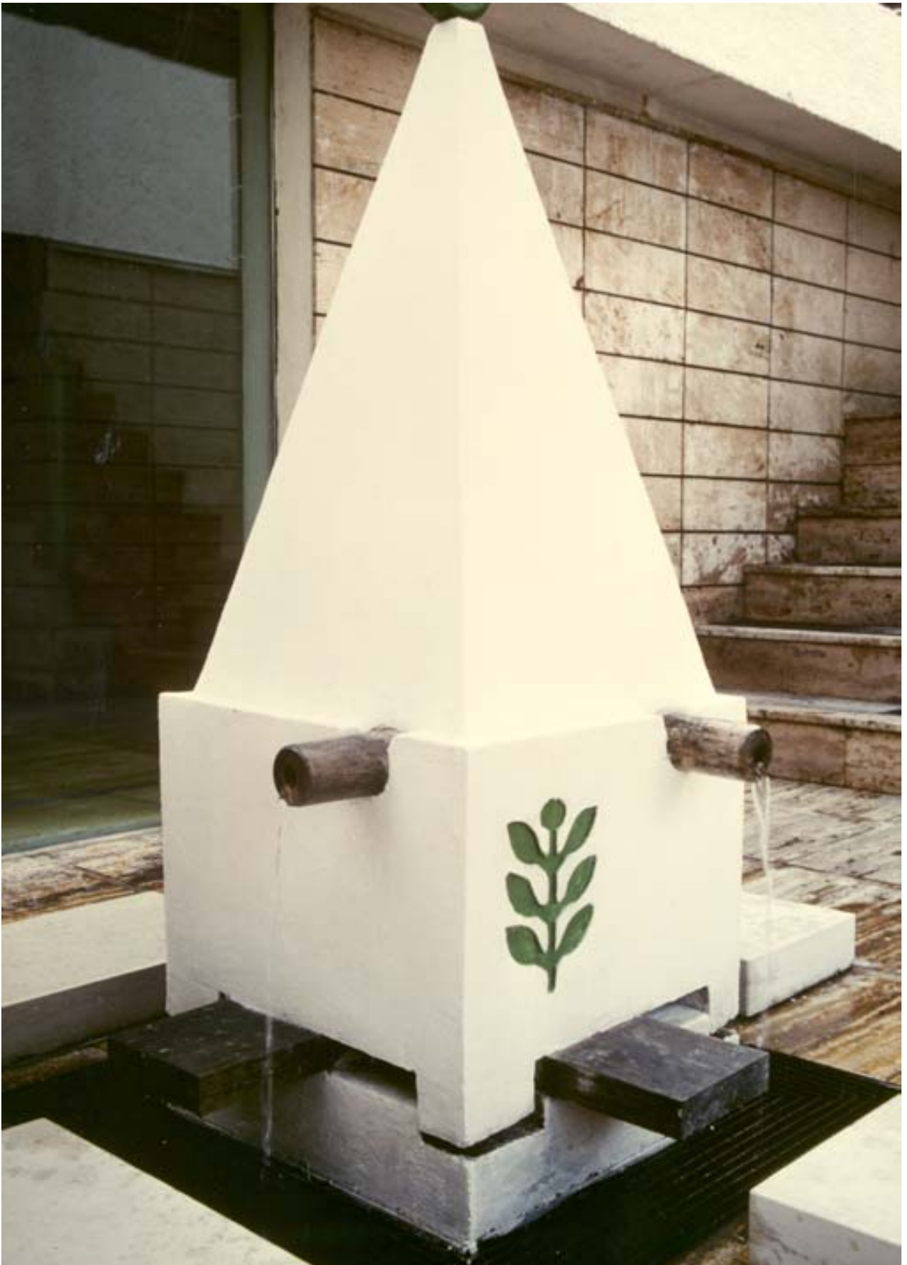
Sherefudin's White Mosque, Visoko, Bosnia-Herzegovina