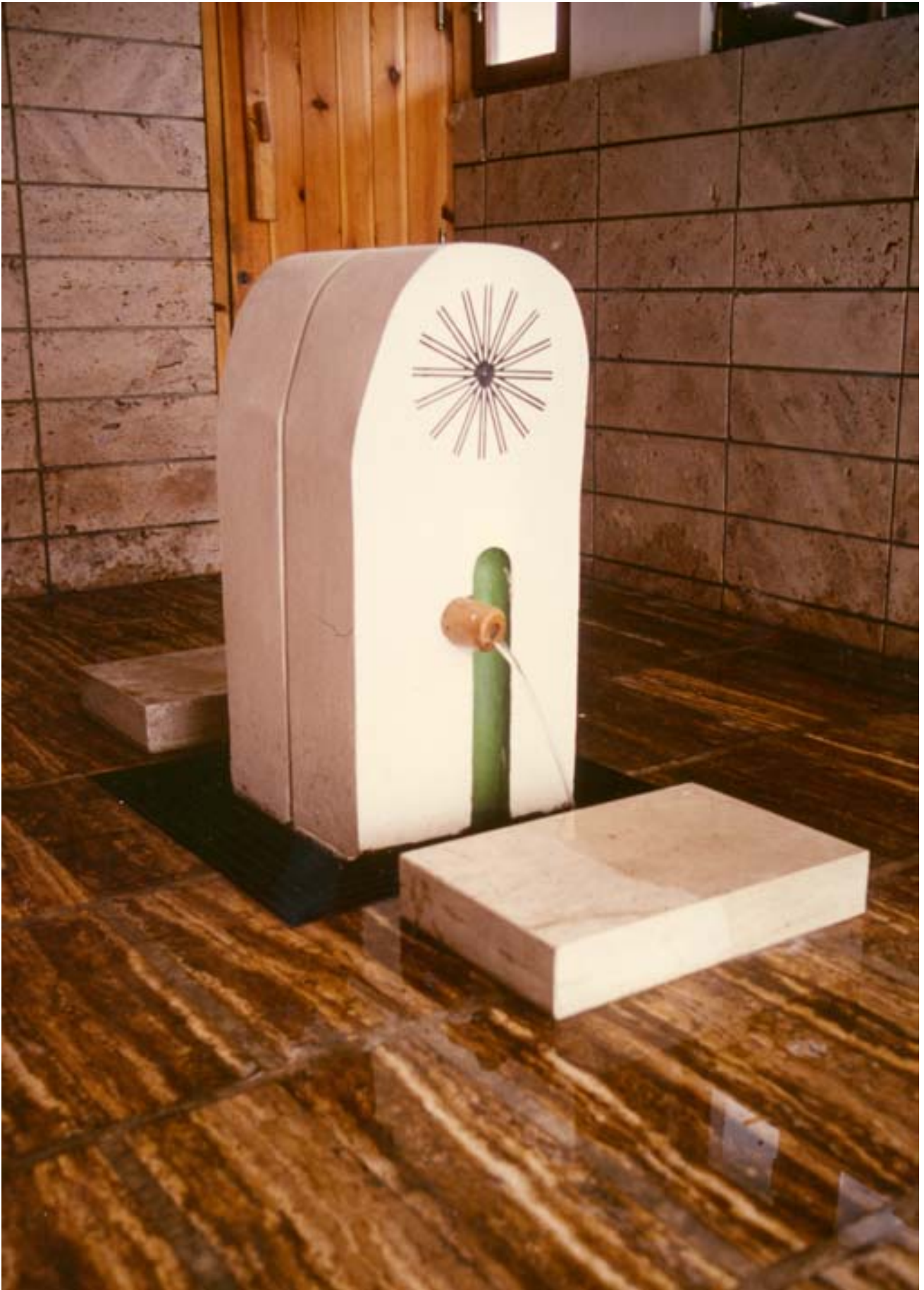
Sherefudin's White Mosque, Visoko, Bosnia-Herzegovina