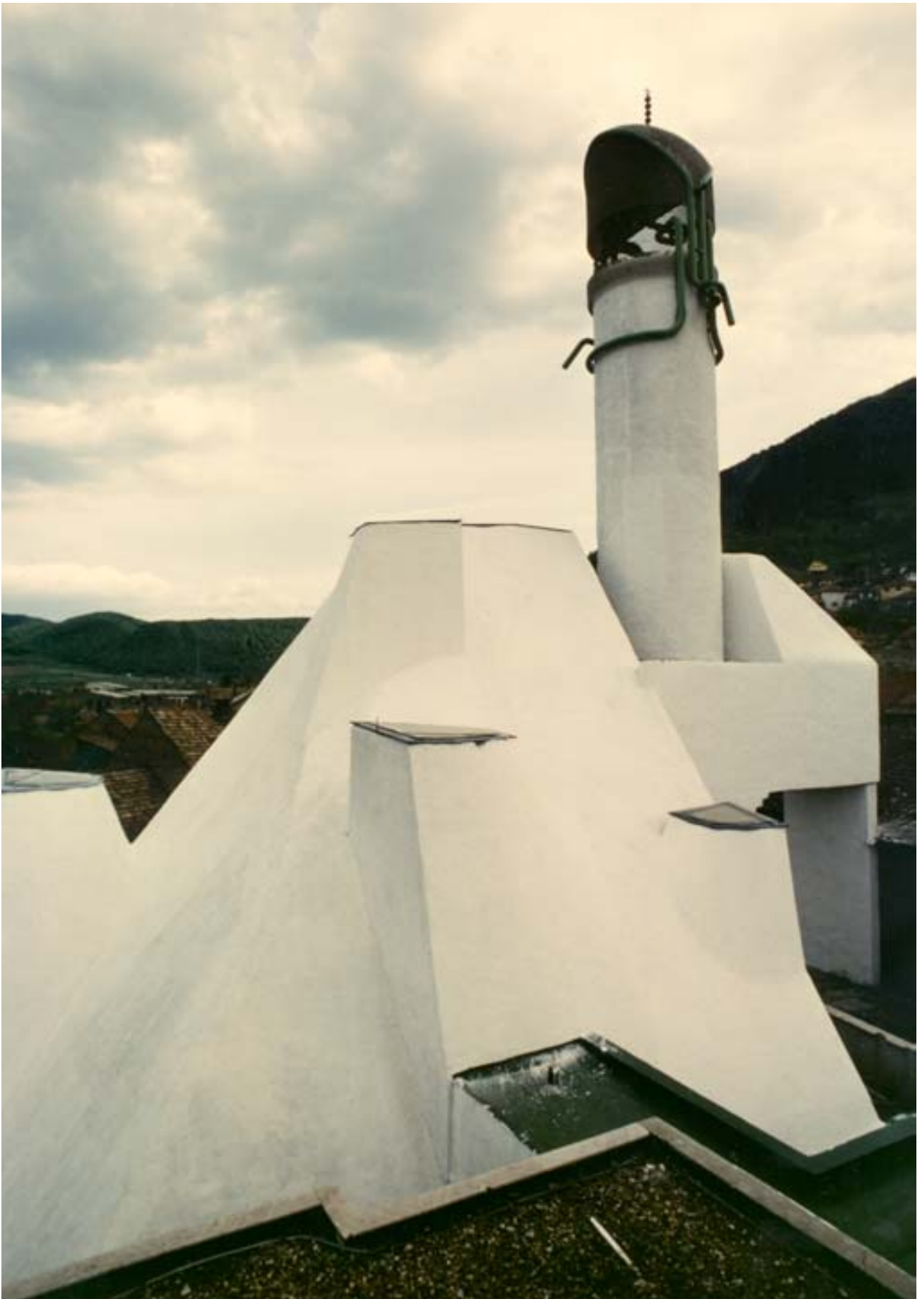
Sherefudin's White Mosque, Visoko, Bosnia-Herzegovina