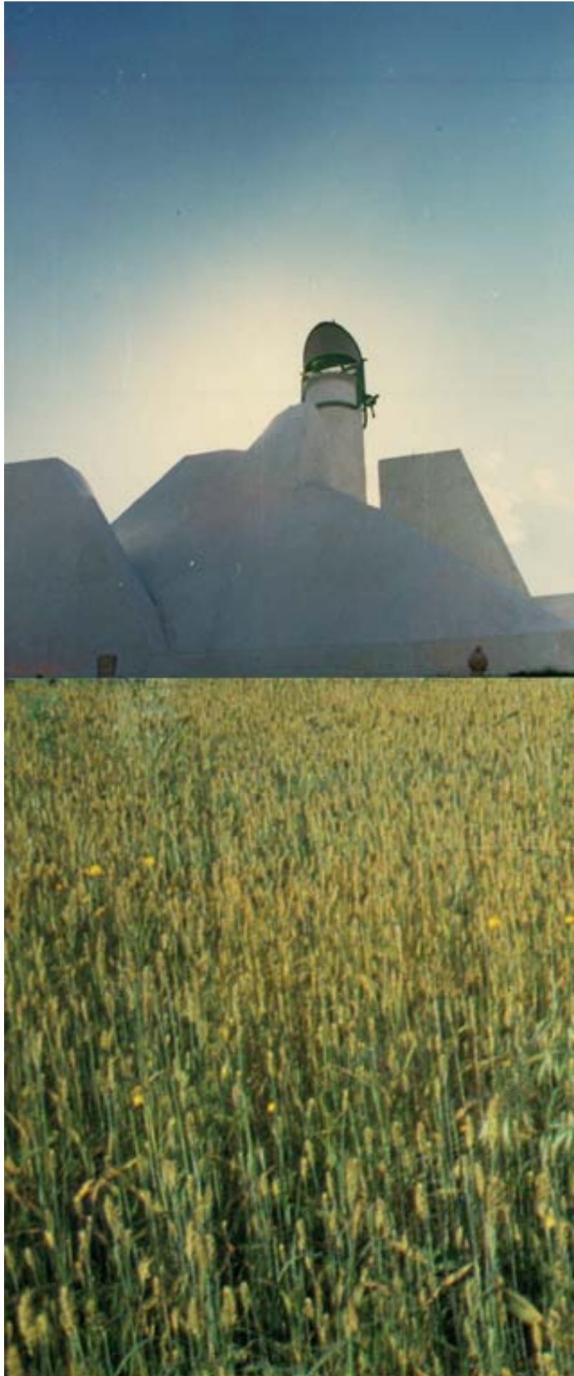
Sherefudin's White Mosque, Visoko, Bosnia-Herzegovina