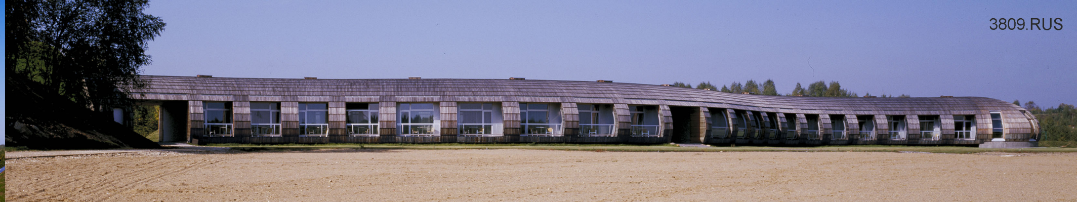
фасад в осях 5-27