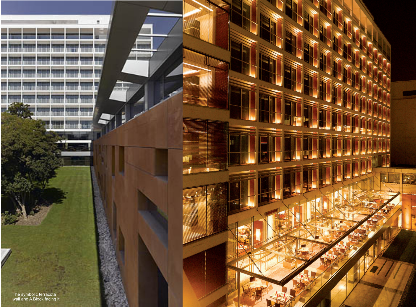
The symbolic terracotta wall and A Block facing it.