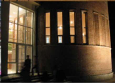
Haut/centre : auditorium bas : entrée côté rue