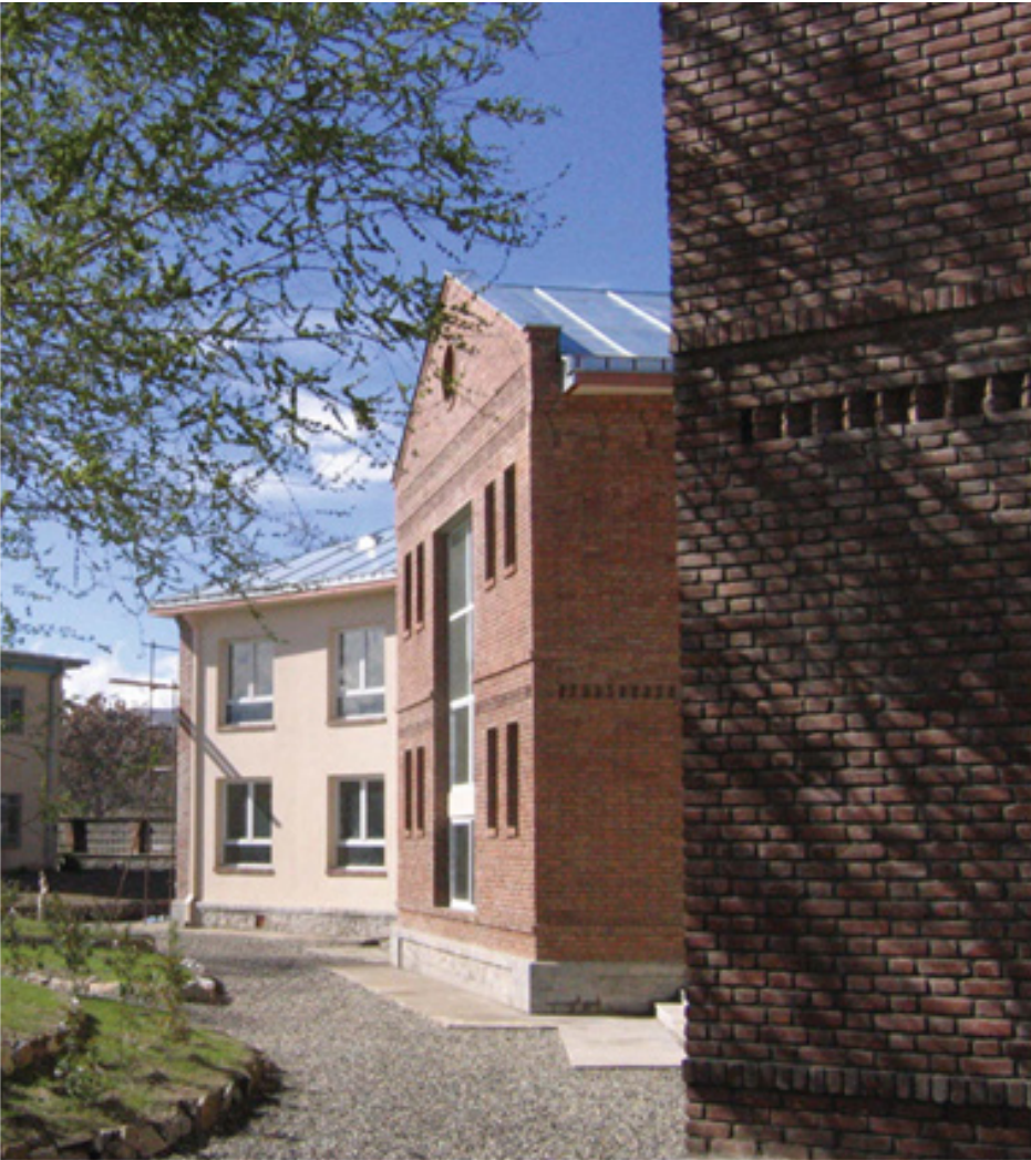
Vue sur jardin de l'institut

Programme The reconstruction improves and expands the centre’s two old buildings that were severely damaged during the war. The new Teacher Training Centre houses academic and administrative functions, including an auditorium, a library, and classrooms equipped with audio-visual systems. Respecting the original structure, the modern reconstruction was achieved by introducing appropriate techniques and using local resources, to insure the brick and cement structure would be earthquake resistant. Traditional Afghan techniques were utilised in the ornamentation, particularly in the brickwork.