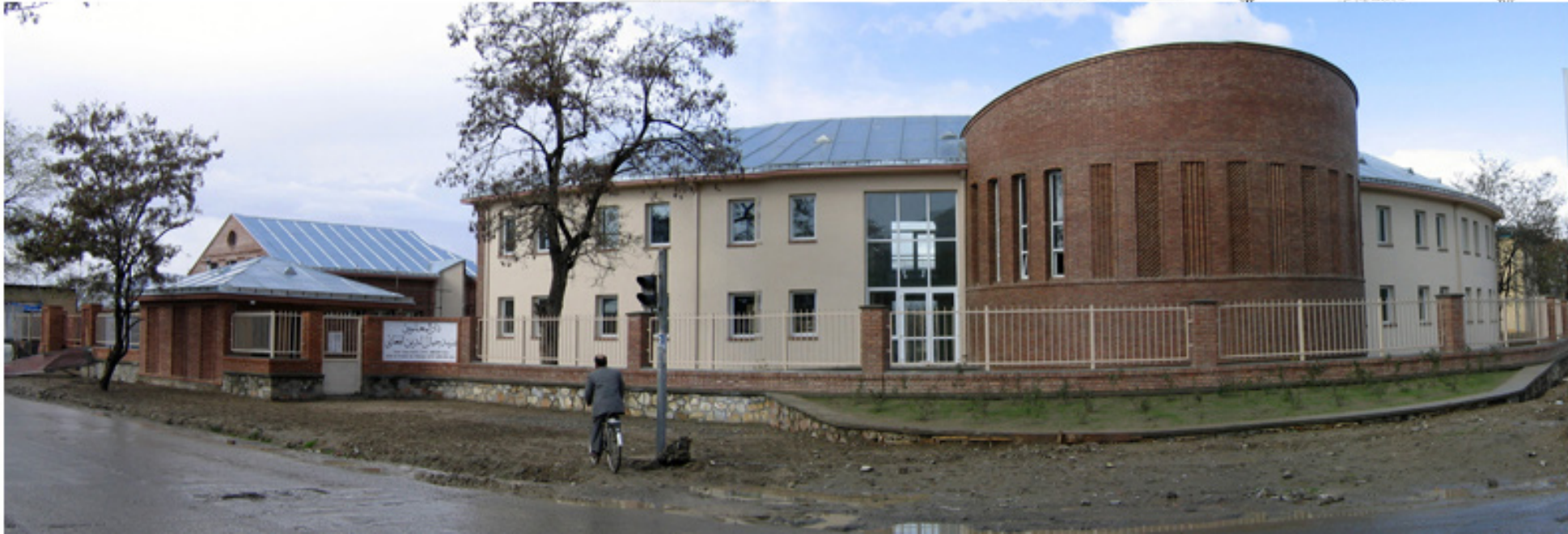
Vue sur rue de l'institut

INSTITUT DE FORMATION DES PROFESSEURS "SAYEED DJAMALUDDIN"