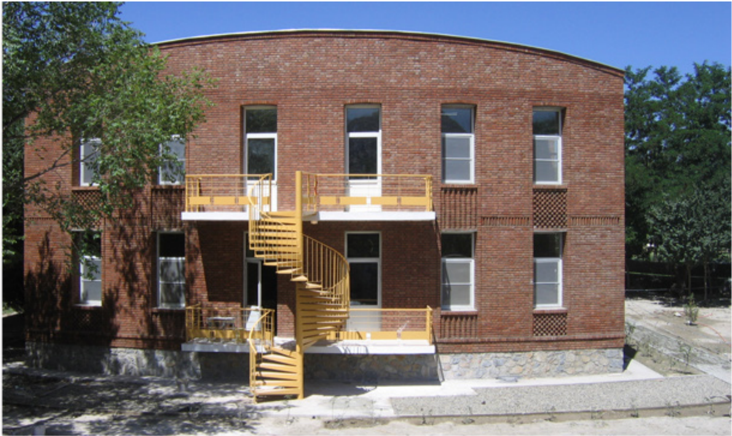
« Département de Français »