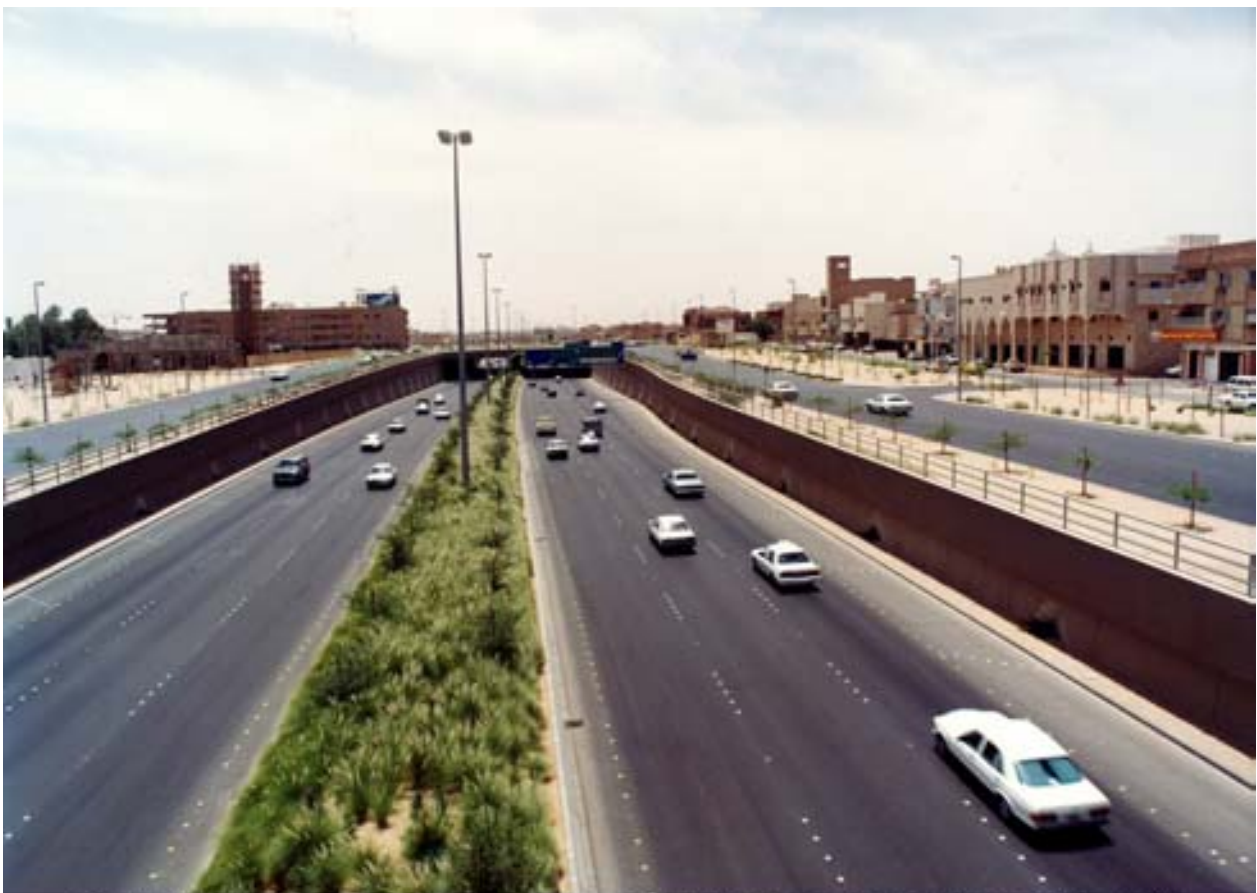
Typical view of expressway showing central landscaping and retaining walls