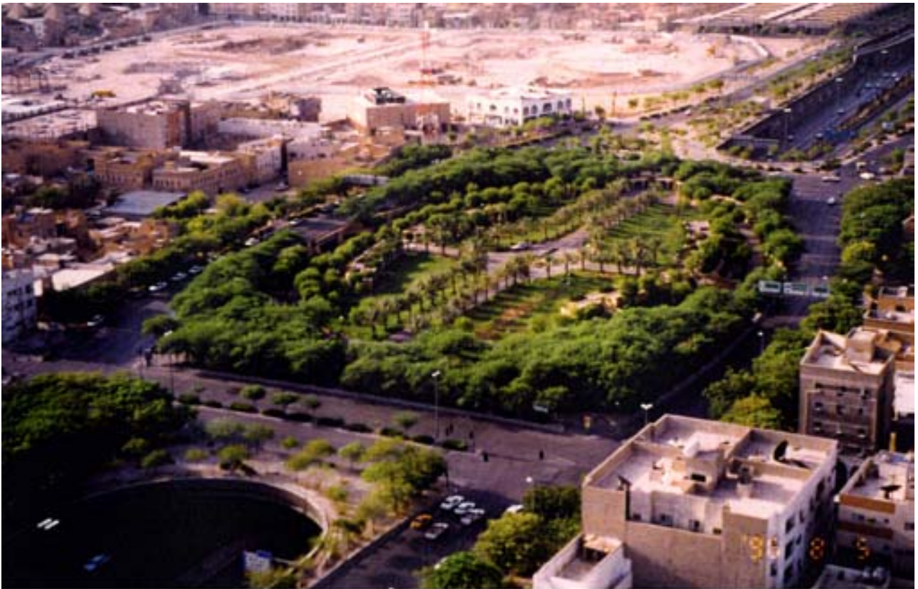
The Central Garden of King Fahd Road as seen from the helicopter, August 1996