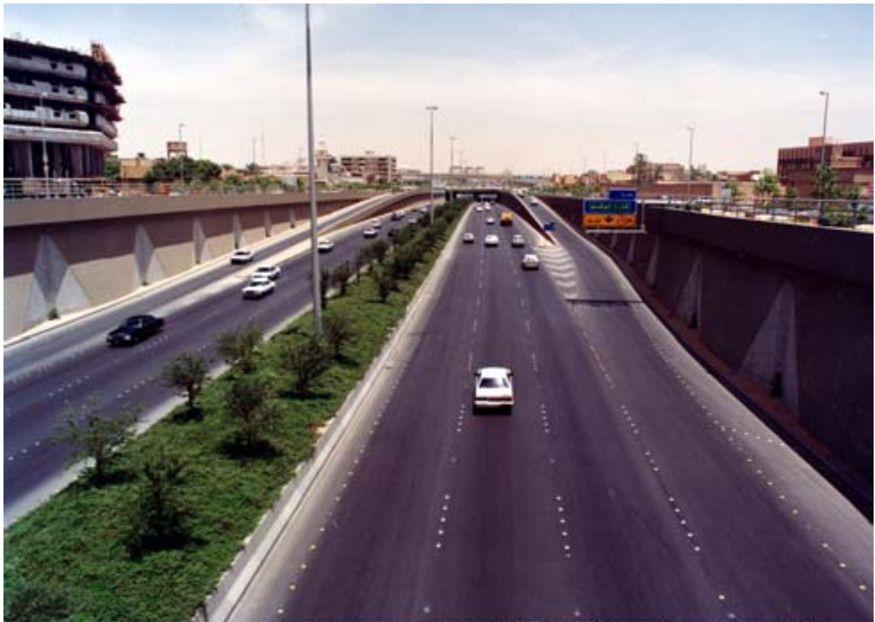
Typical view of expressway showing central landscaping and retaining walls