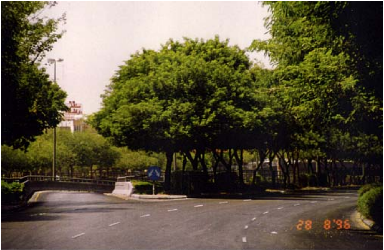
Access Roads and walkway along King Fahd Road, photos taken while driving or walking, August 1996