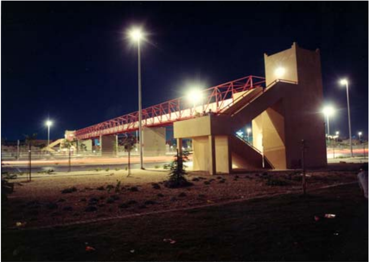
Pedestrian bridge and landscaping, at night