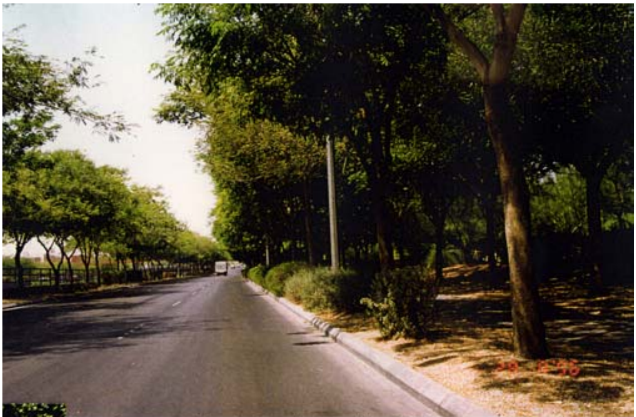
Access and Service Roads to and beside the expressway as seen from the car, August 1996