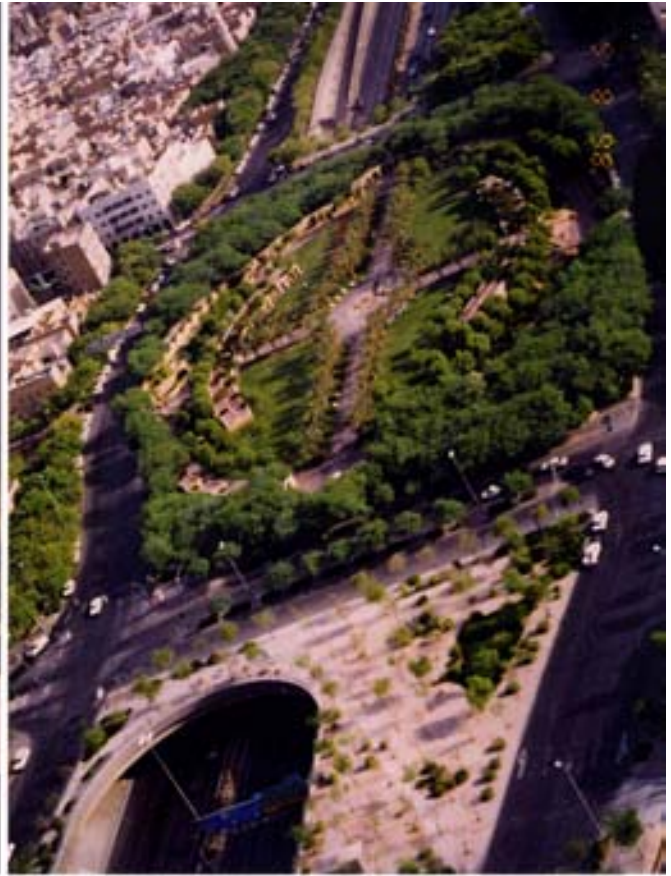
The Central Garden and its connection to the linear road landscaping, as seen from the helicopter, August 1996