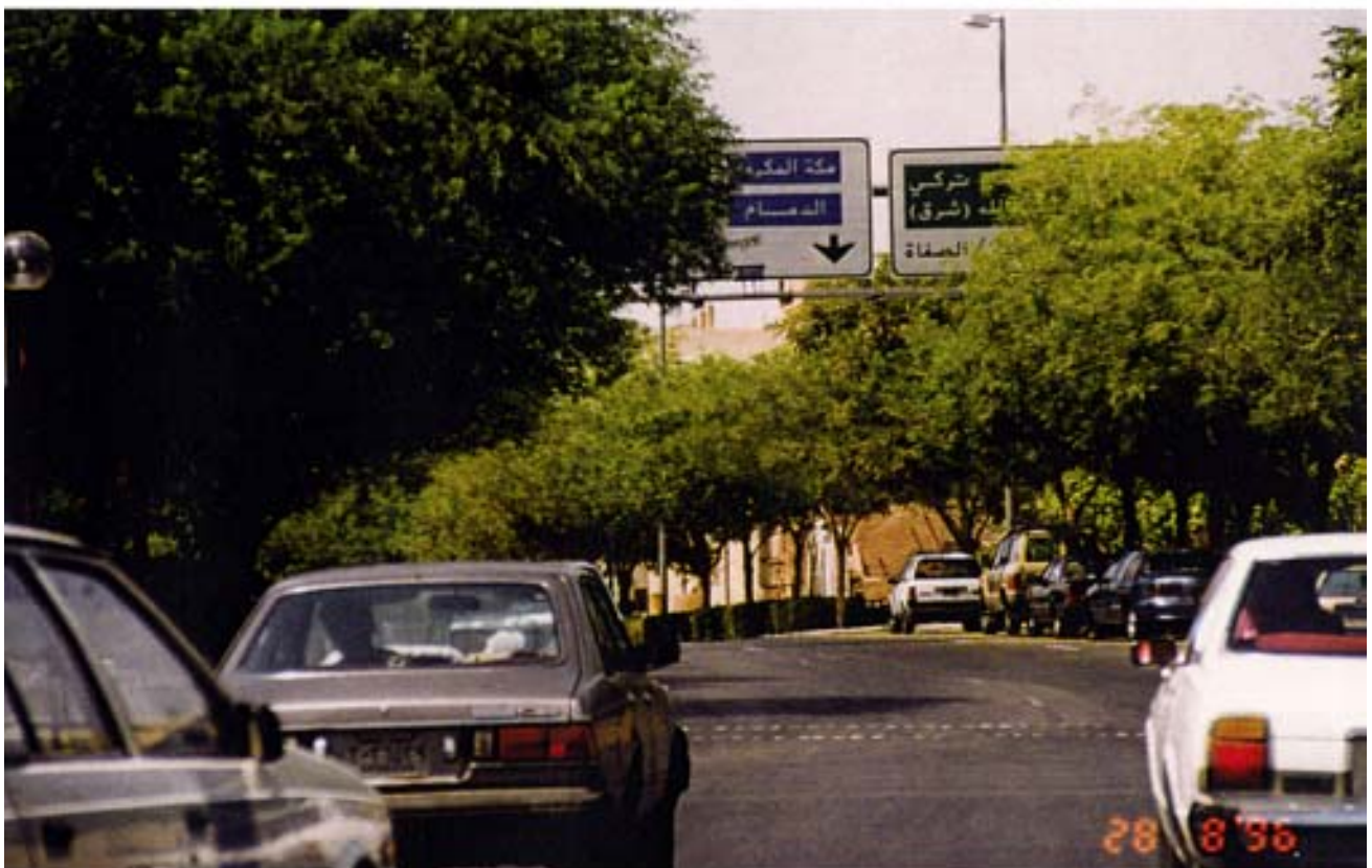
Access and Service Roads to and beside the expressway as seen from the car, August 1996