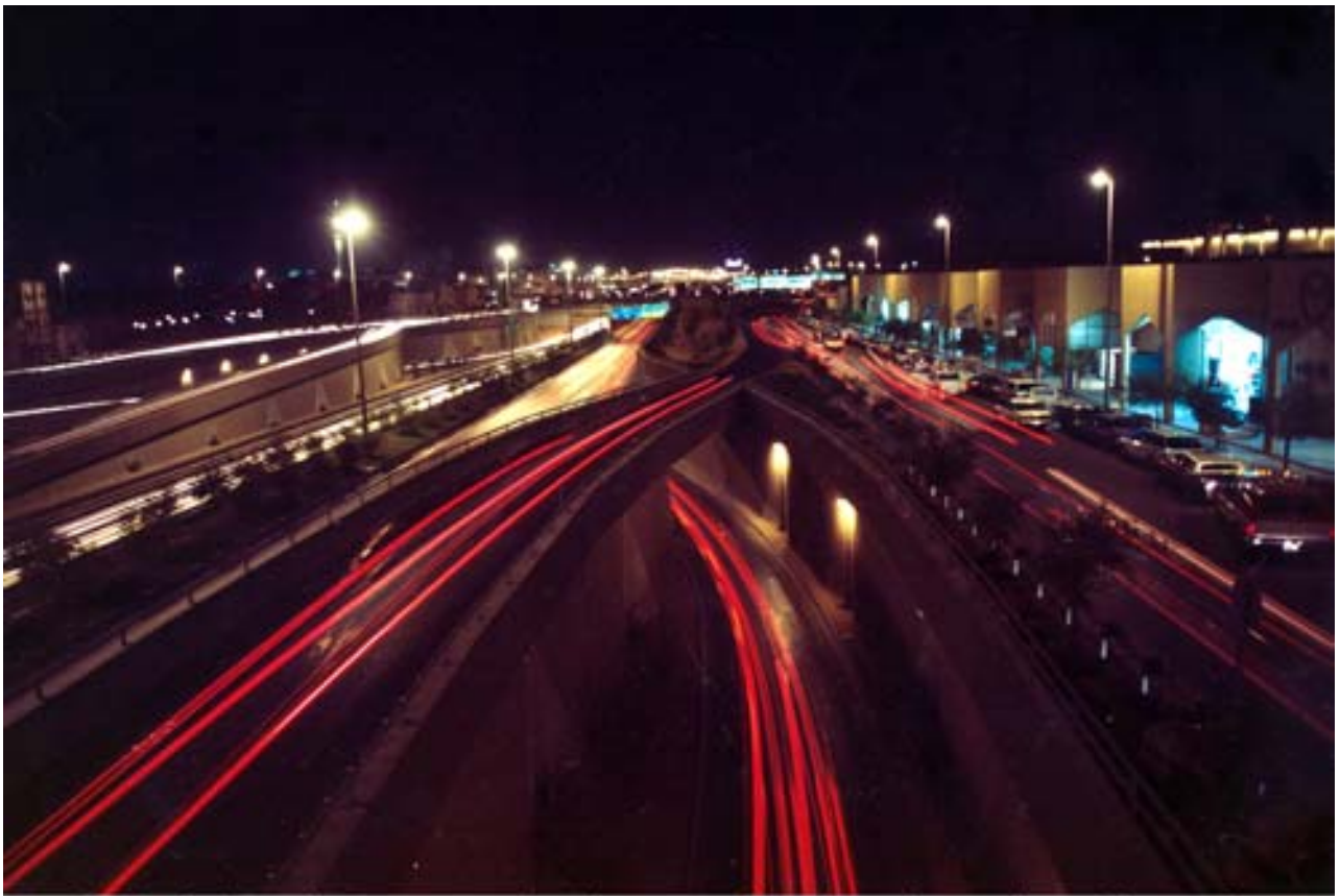
Typical view of expressway showing central landscaping and retaining walls at night