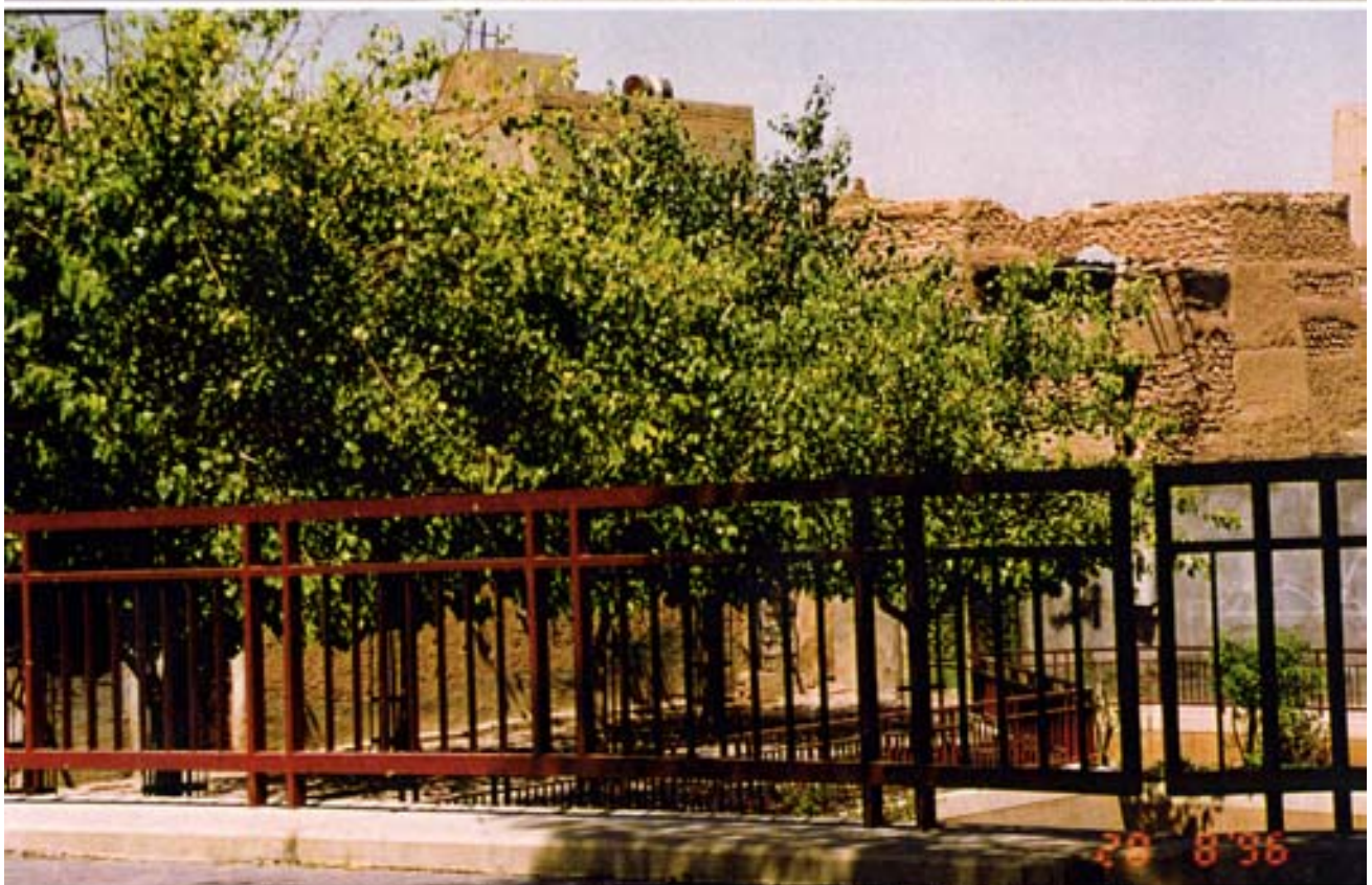
Access Roads and walkway along King Fahd Road, photos taken while driving or walking, August 1996