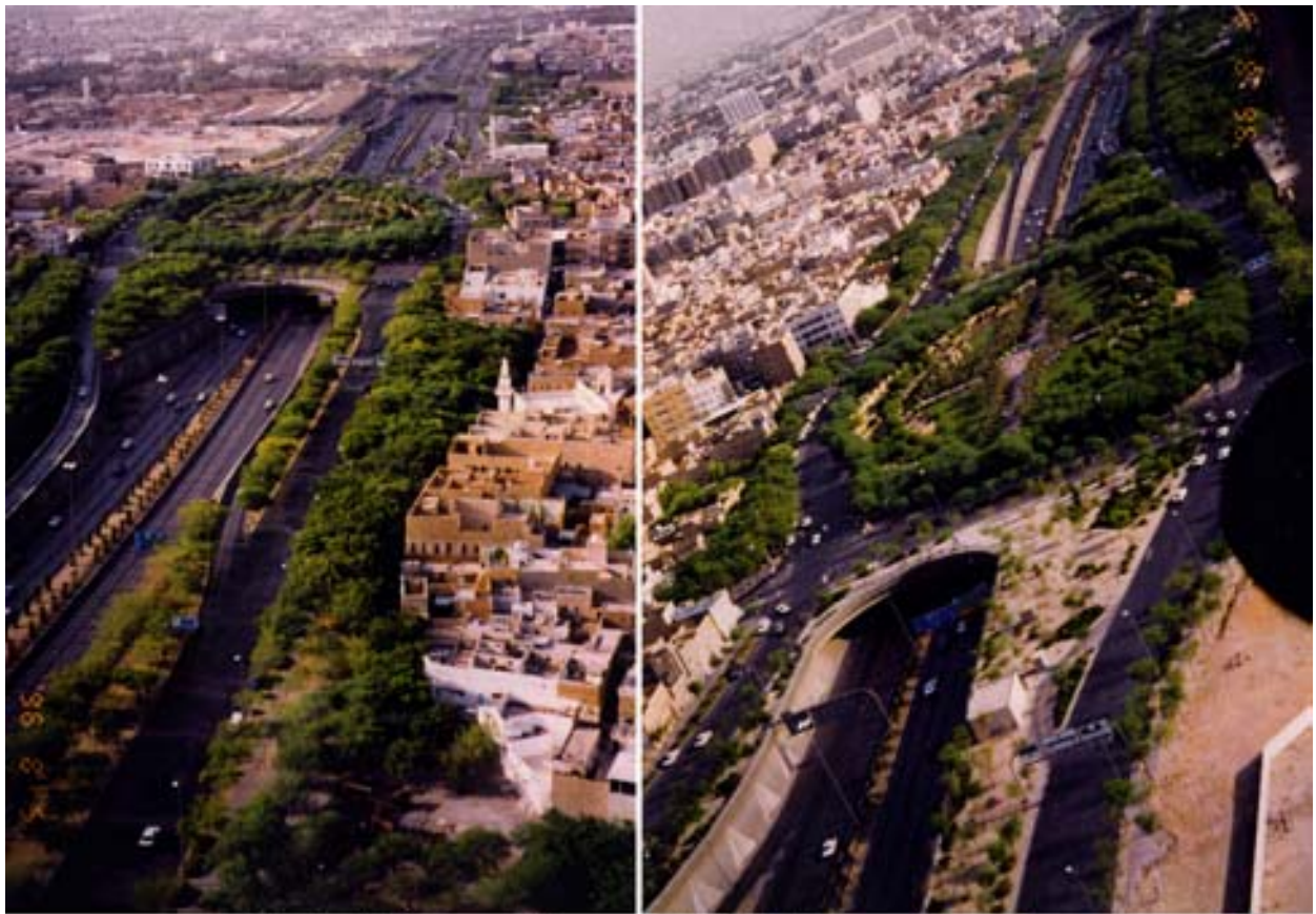
The Central Garden and its connection to the linear road landscaping, as seen from the helicopter, August 1996