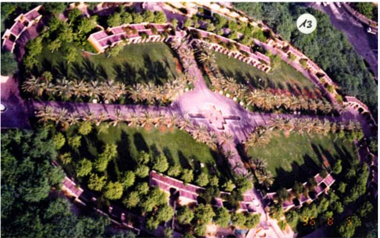
The Central Garden of King Fahd Road as seen from the helicopter, August 1996