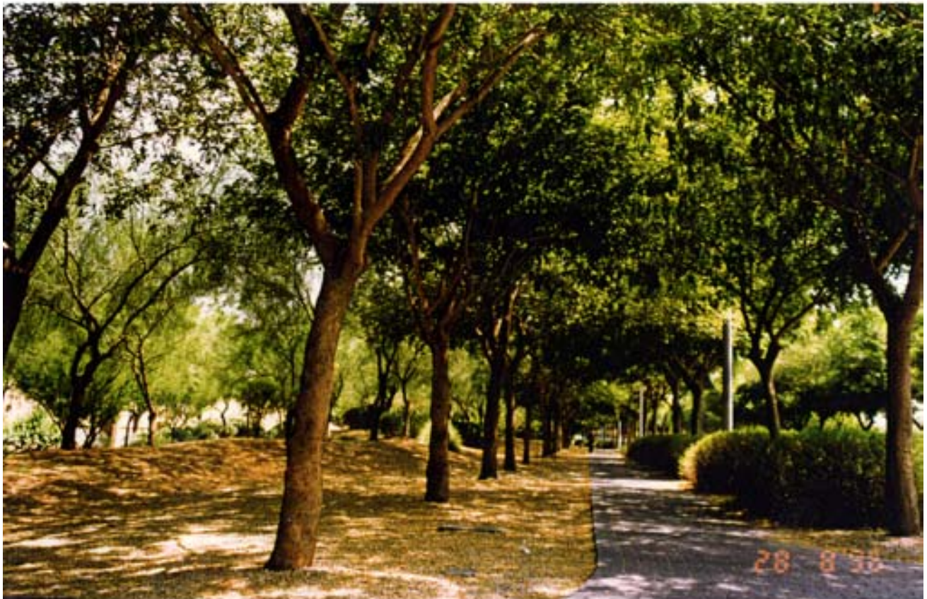
Access Roads and walkway along King Fahd Road, photos taken while driving or walking, August 1996