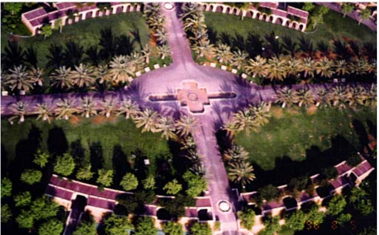
The Central Garden of King Fahd Road as seen from the helicopter, August 1996