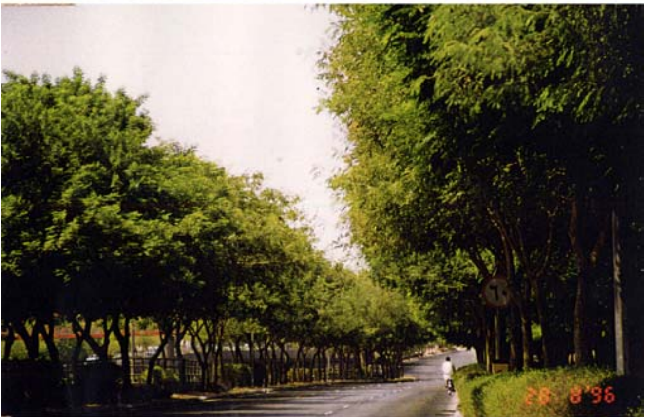
Access and Service Roads to and beside the expressway as seen from the car, August 1996