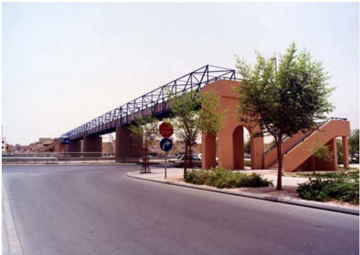
Parallel service road and pedestrian bridge