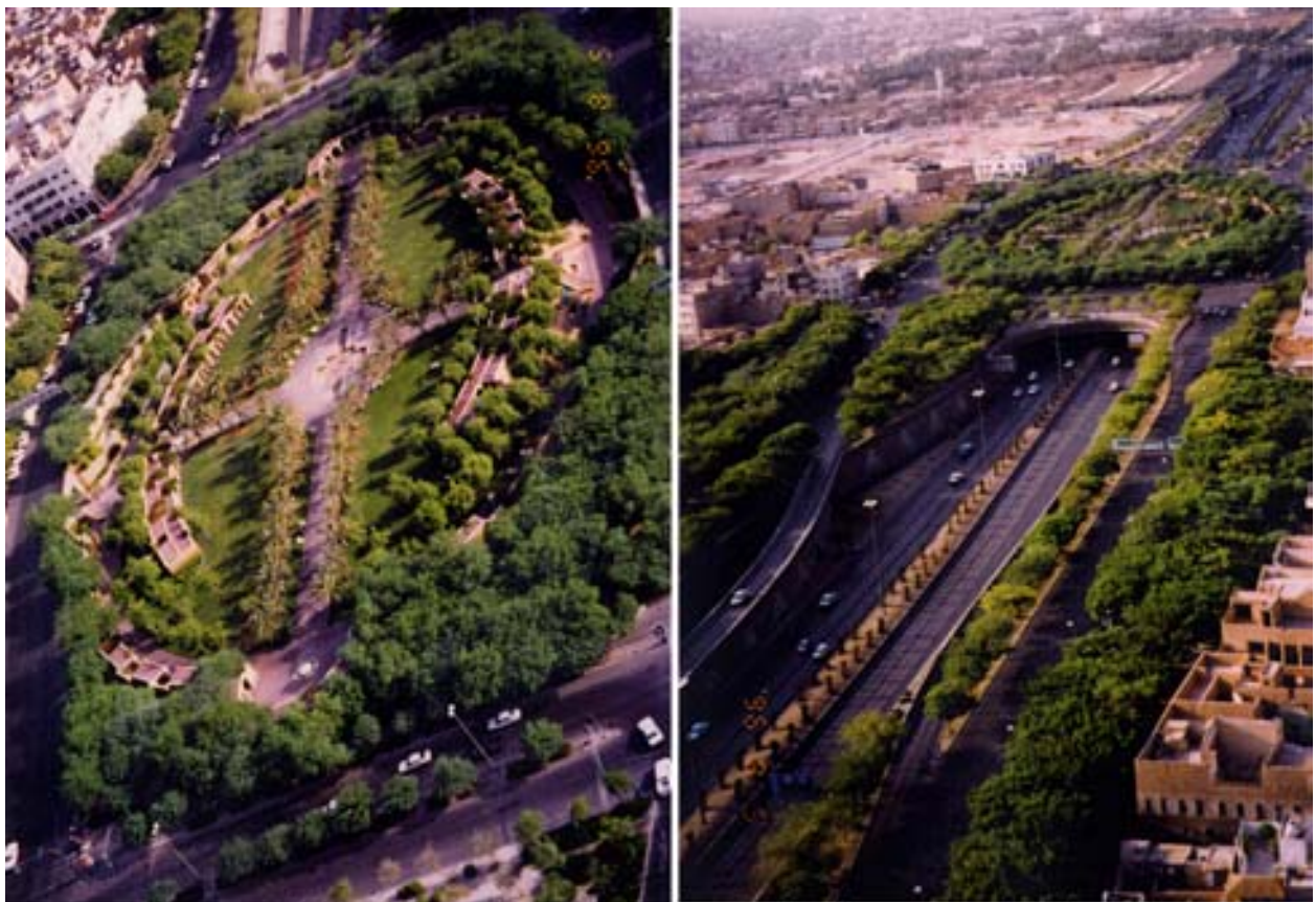
The central Garden and its connection to the linear road landscaping, as seen from the helicopter, August 1996