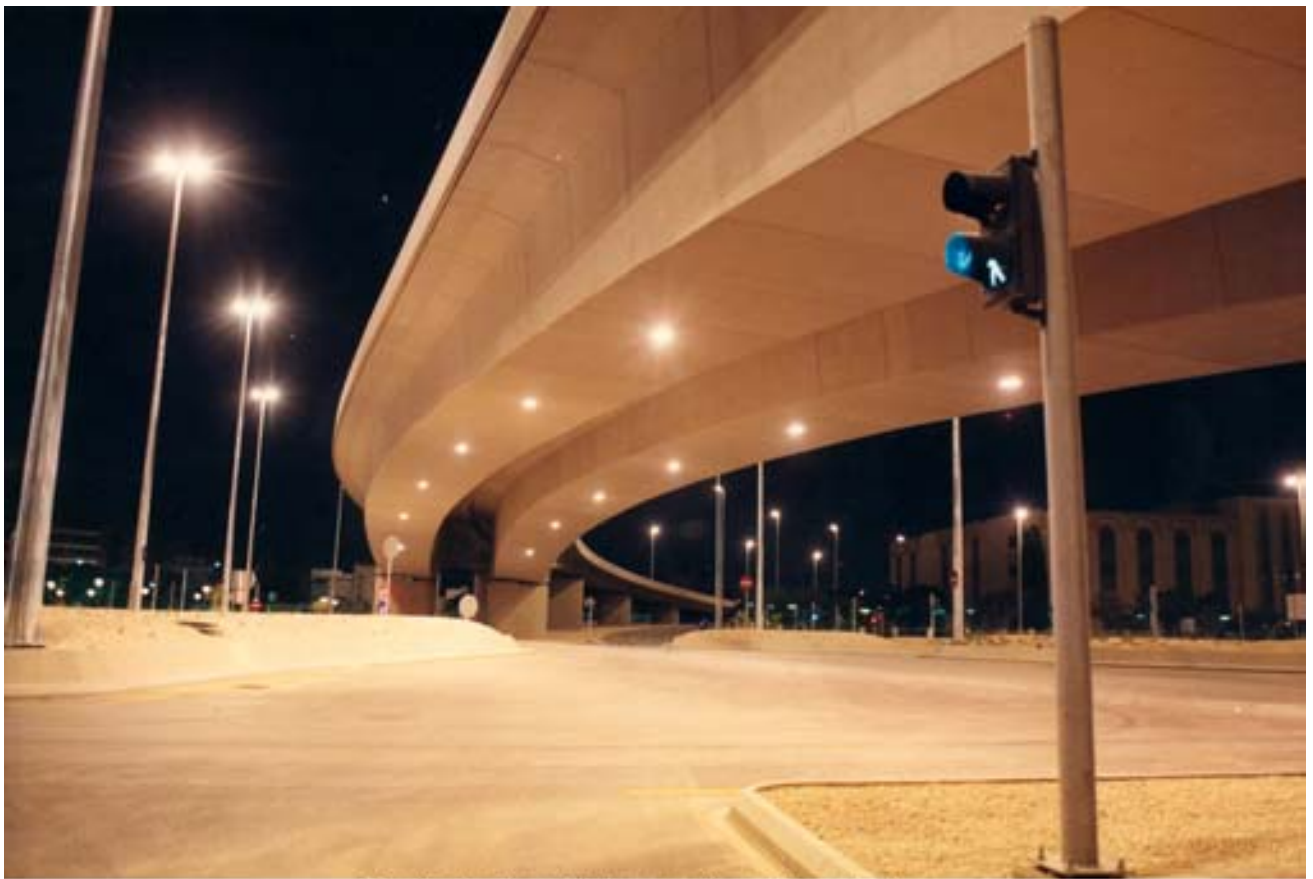
Typical raised intersection, from below