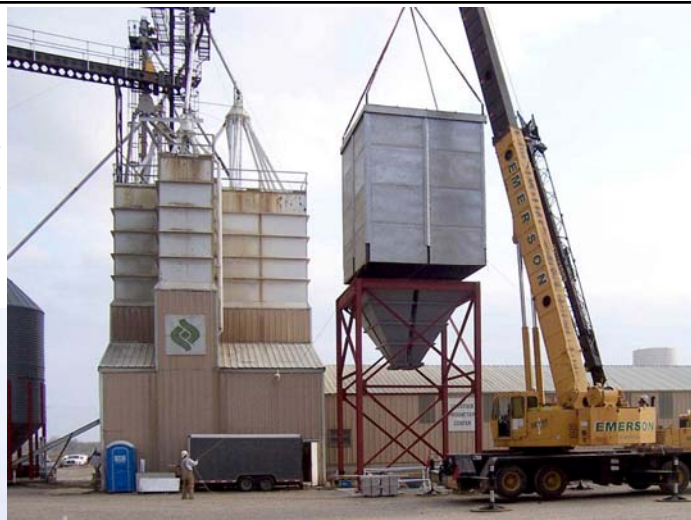
Reinbeck mill before ———→ improvements