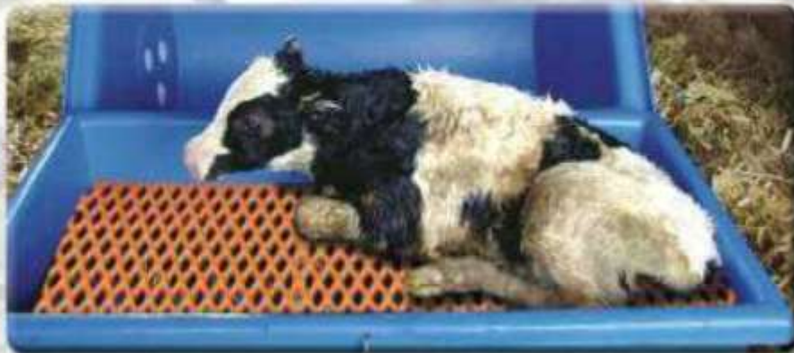
The PolyDome Calf Warmer provides a comfortable environment for newborn calves.

The PolyDome Calf Warmer provides a comfortable environment for newborn calves for the first few hours after birth. The top section is hinged, and removable, for calf entry. The floor is raised and slotted for easy heat circulation of the entire unit. There is a vent/peep hole on one end for proper ventilation and viewing the calf without opening the unit. The bottom is ribbed, and the front rounded, for easy transportation. The front is molded to accept an optional steel hitch for towing.