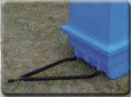
Optional rigid hitch for easy towing