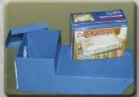
Deluxe, high-performance heater is enclosed in a moisture resistant box.

The entire unit is made of medium density polyethylene for long-lasting durability and easy cleaning.