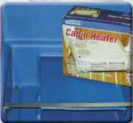
The raised, slotted floor allows for adequate warm air circulation. It can be lifted out for easy cleaning and disinfecting. PolyDome uses stainless steel for the supports.