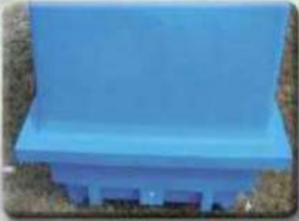
Bottom is ribbed, rounded on the front, and molded to accept an optional hitch for easy transportation.