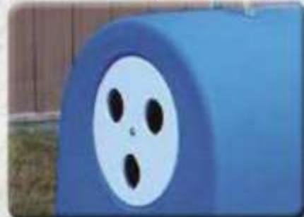
Vent / peep hole for proper ventilation and viewing