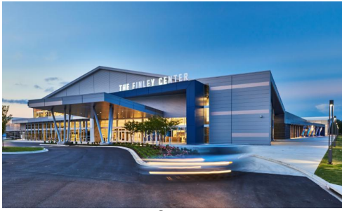
2018 Building of the Year - Hoover Sportsplex Dunn Building Company Birmingham, AL

all come into play when judging these projects. The awards ceremony will take place during the opening session where we'll be joined by MBMA members so plan now to attend this prestigious event. Submit your projects by February 15, 2019. New this year is a Reroof/Renovation/Addition Category by your request!