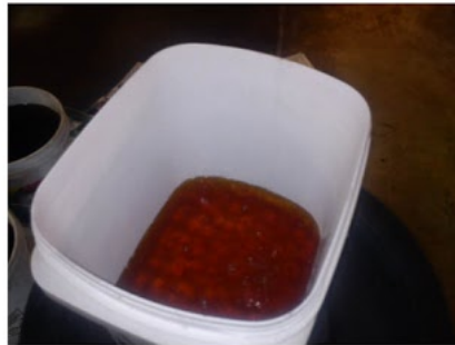
Gasoline drained from the tank, normally clean and clear, contaminated beyond recognition.

After more waiting, the car arrived. The motor would turn over, but there was no start. The clean title didn't reflect a replaced fender and the sun had warped and ate away at more than just the paint. This wasn't even counting the several types of spider that took up residence in the car. When the vehicle was left in the field the fluids were left in it for better or worse. At no point did I question that I wanted this car.