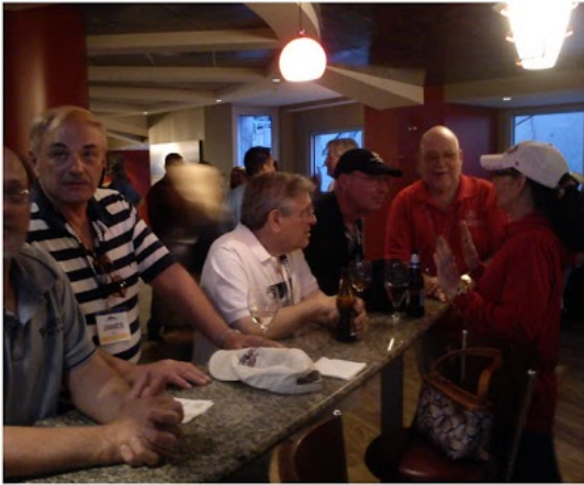
The weekend started with a dinner at the Cincinnati Red's Diamond Club.