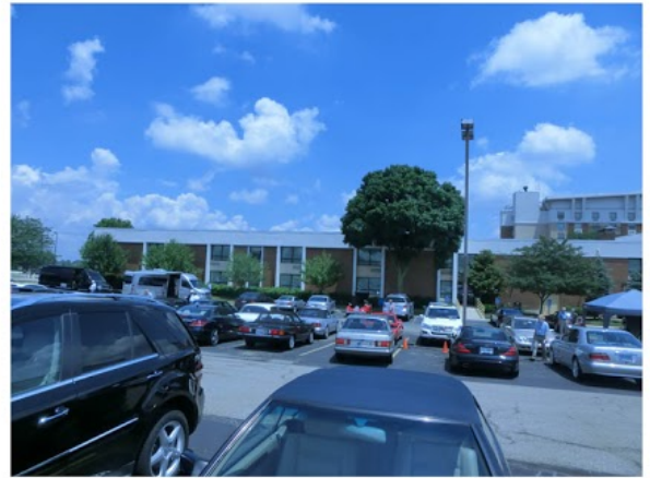
The turnout for Startech was amazing. The parking lot for the event had a wonderful array of cars from all over the country.