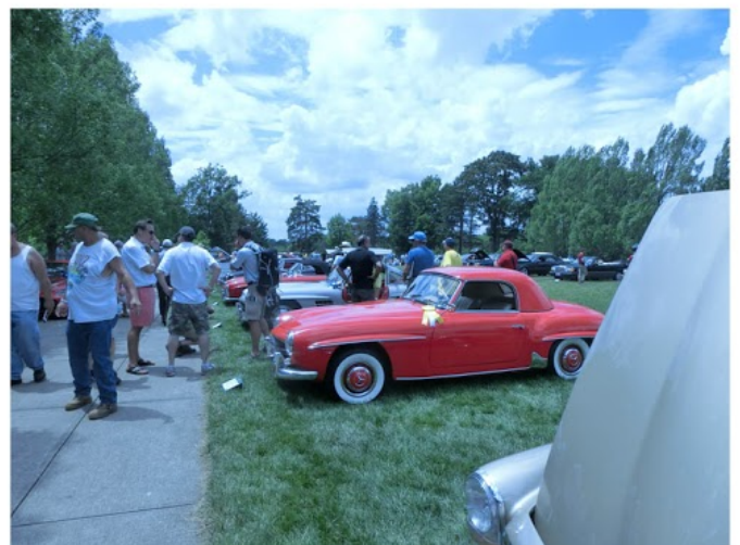
With Mercedes being the featured marque, the Ault Park Concours had a wonderful array of cars. As rare as they are, it was a great opportunity to see several healthy example of the classic SL.