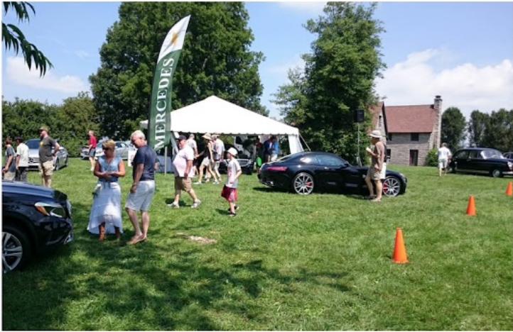
James Motor Company brought cars new and old to their tent atop the hill at the Keeneland Concours