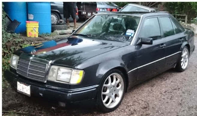
A long way still to go, but washing five years of dirt is always an improvement.

All in all the car still has a long way to go. With the old gas the color of sweet tea, some questionable wiring, and the hard to diagnose ABS/ASR problem that would doom a lesser car. But, after seeing what one of these cars can be at both Keeneland and Ault Park, I've never had more confidence that this one deserved to be saved from rotting in that field.