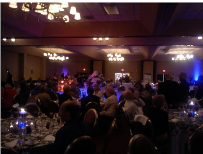
Saturday night concluded with a fine dinner. The Cincinnati Section did an incredible job with the event.