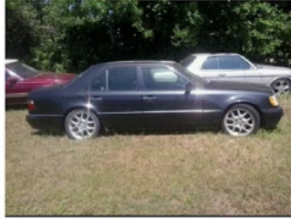
The first image seen of the car.

There are many times when you hear of something too good to be true, something that it would be better if you just left it be and gone on with your way. This was something that I decided not to do when I got a simple message from someone. "I've heard a rumor of a 500E, it might be for sale." What followed was a series of three pictures, none of them were great in detail. A tiny profile shot showed that it was sitting uncovered in a field wearing a set of aftermarket rims. A rear shot showed the badge held true and the paint had been baked in the Texas heat. And a shot of the rear seat proved that it had everything inside you'd expect on the surface. This was in April.