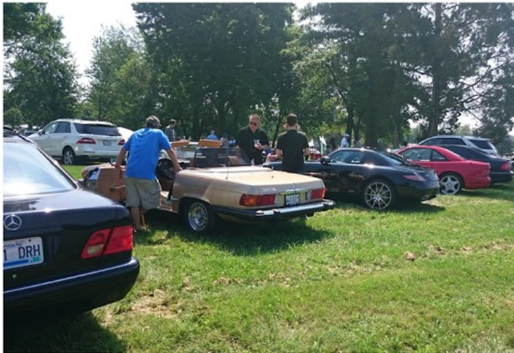
In the Mercedes Benz Club paddock parking a wide variety of cars made a showing. From ML and E class cars to the powerhouse SLS AMG