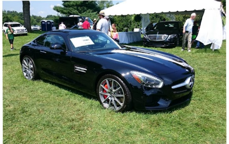
Two of the crowd favorites were the brand new AMG GT-S and the S550