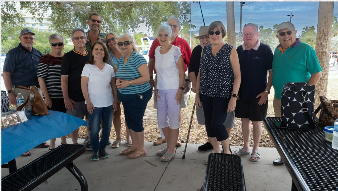
Picnic at Veterans Memorial Park April 22, 2023