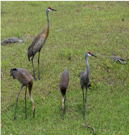
Another tour group...