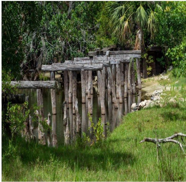
Wooden Railroad Bridge