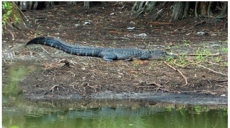
Right: Local resident