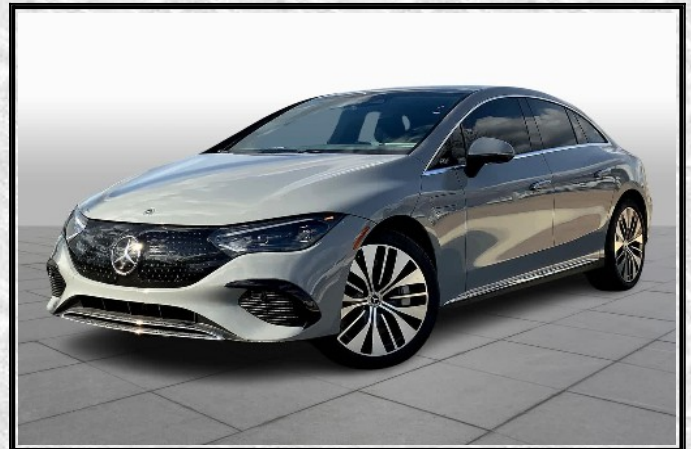
2024 EQE 350 – All electric