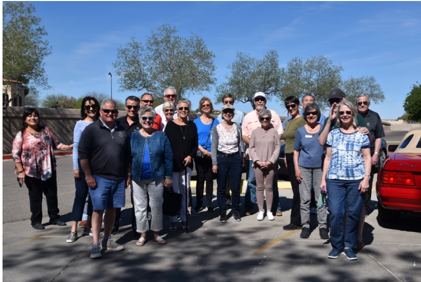
The Group at Coffinger Park in Wickenburg