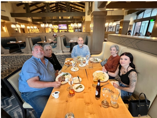
A great meal at Little America