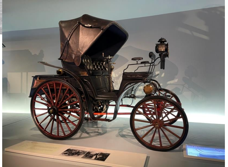
1893 Benz Vis-à-vis