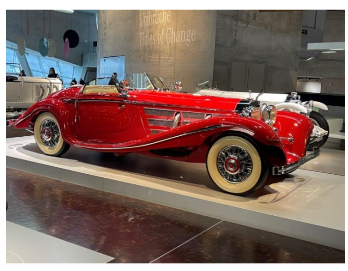
1936 500K Special Roadster

When visiting the Mercedes from the 20's and 30's I found my favorite car of the Museum.