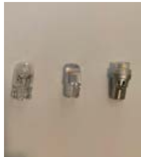
Incandescent T10 Bulb Vs. Non-CANBUS Bulb Vs. CANBUS Bulb (L-R)

Most, but not all, LEDs in the interior and trunk of the E class are not monitored for “bulb out” by the car’s computer systems so CANBUS (the car’s computer network) or non-CANBUS bulbs can be used. On an E class (W212), the footwell lights under the dash are an exception to this. I have found that, generally, CANBUS bulbs are superior in quality to non-CANBUS bulbs, and I’ve used them everywhere although they are more expensive. I’ve had no CANBUS bulb failures.