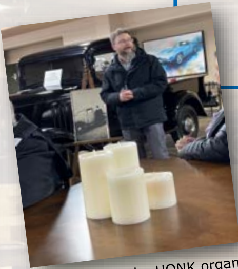
Members from the HONK organization served as tour guides.