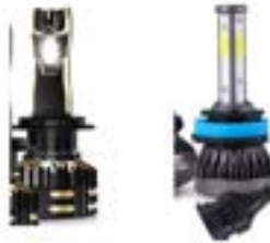
“Modern, Quality” vs. ‘Early, Questionable Design” LED H7 Bulbs

Firstly, let me state that recent, quality LED headlights are FAR superior to those made even a few years ago in brightness and design. Unfortunately, instead of being discontinued, those older designs went “downmarket” and now sell for 15-50$ per pair. In my opinion, these are all garbage and may in fact be dangerous to use (see below as to why). Designs that are small and thin (see image) are far superior and contain copper heat pipes and quality, long-lasting ball-bearing equipped fans. These will generally cost 80-150$ a pair.