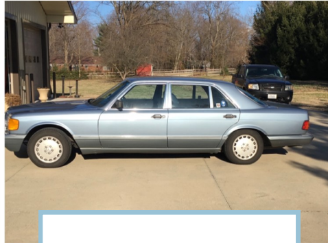
1988 MB 560 SEL