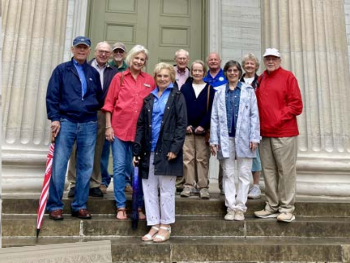
The "Old State Capitol"