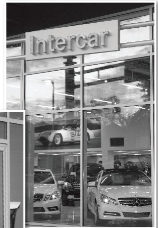
Pickup and delivery - Loaner car.