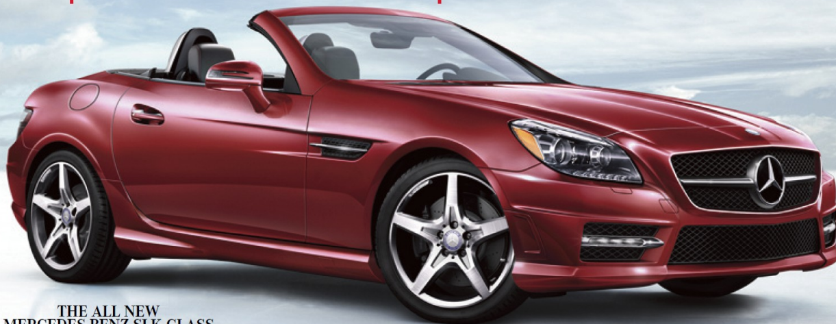
THE ALL NEW MERCEDES-BENZ SLK-CLASS

Three choices in power hardtops, any of which can vanish into the trunk in under 20 seconds.