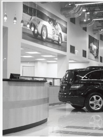
Convenient customer service DRIVE-THRU.

An exceptional dealer, with exceptional new & pre-owned prices.