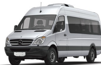
New 2013 SPRINTER line

The Mercedes-Benz Sprinter proudly joins the rest of the Mercedes-Benz models NOW at Intercar.