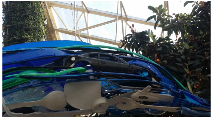
Note the toy car body in the middle of this dolphin.