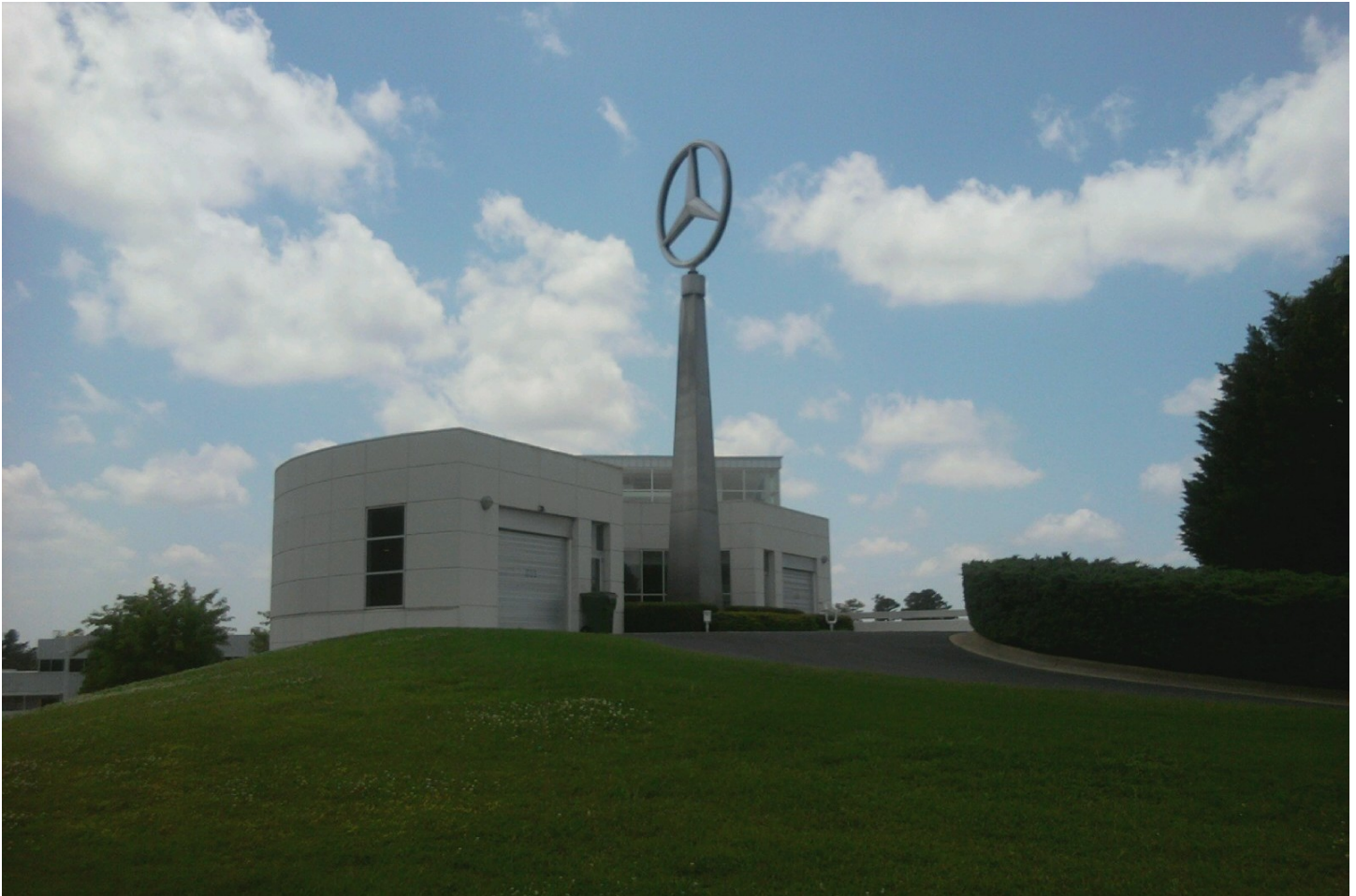
The Visitor's Center for MBUSI in Tuscaloosa, AL

StarTech 2013 began on May 18 th and concluded on May 21 st and packed a wealth of information and loads of fun in between. I was the only member from the Three Rivers Section attending, but there were members there from all over the country, including California. We were honored with a special tour of the NASA Space and Rocket Center in Huntsville, AL. Anyone can visit and tour the facility, but not everyone gets a tour given by some of the people who actually worked on the original propulsion system developed to propel our first astronauts into space. What a privilege it was to talk to them!