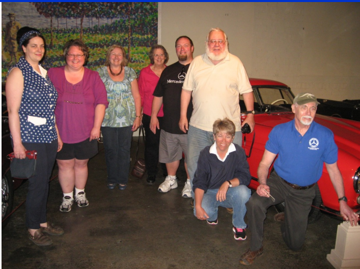
Several members pose in front of an SL at the ACD Museum on May 5 th .