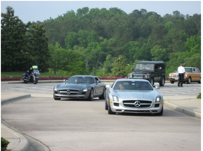
Two SLS’s return from their trip around the Barber Track