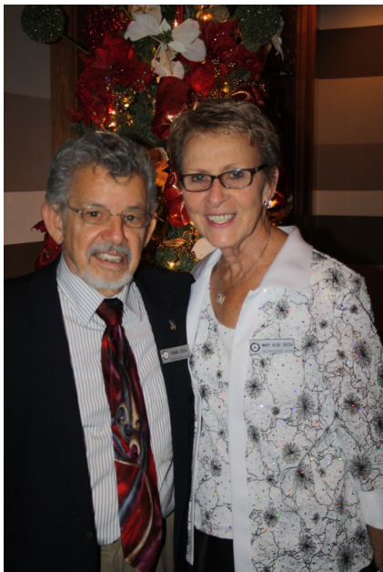
Lower Left to Right: